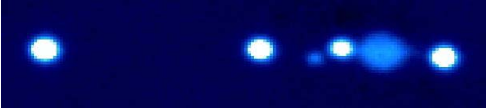
Fig. 3 – The Uranian satellites as seen with the NTT in the K'-band. The planet Uranus is darker than the satellites (except the small Miranda)