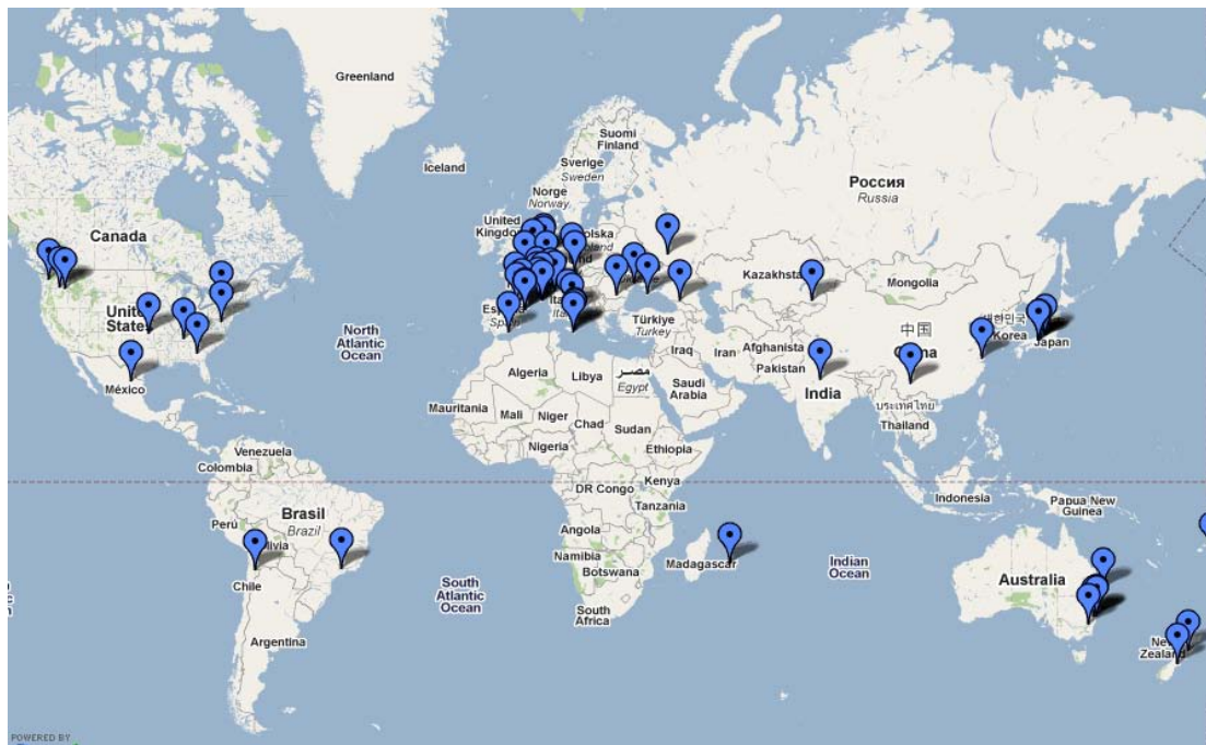
Fig. 2 – The present PHEMU network of observers

To day, small fast CCD cameras such as Watec are widely used associated to 20 or 30cm-aperture telescopes: such material is easy to get and the number of observing sites of the network increases. Nowadays, the network (cf. figure 2) allows observing as many events as possible and includes ninety percent amateur astronomers. Internet provides help and software for the reduction to the observers and images are broadcasted through the Web.