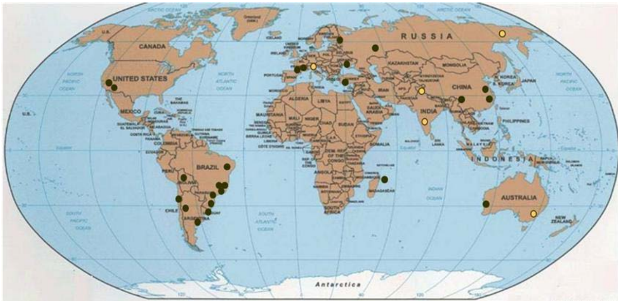
Fig. 1 – Geographical location of observing sites contacted to participate to Gaia-FUN-SSO

be to discriminate these detections, in particular for the detection of moving objects. Ground-based networks, such as the Gaia-FUN-SSO network, will be solicited for a contribution to this task.