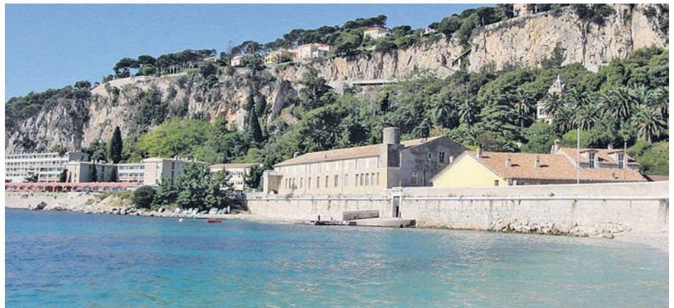
Contemporary view of the Station Zoologique in Villefranche-sur-Mer, suggesting that as viewed from the Bay of Villefranche, little has changed in 100 years.