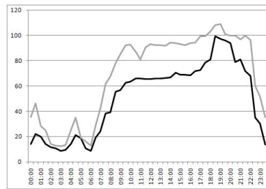
Fig. 1: Load vs time

We adopt a pricing strategy based on network load. Indeed, we see in fig.1 an example of load throughout a day at two different fixed prices. This chart shows that load is price dependent, and so the importance of choosing a pricing strategy based on network load.