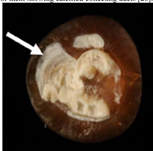
Fig. 3 Whewellite stone initiated from a carbapatite Randall's plaque (white arrow)

Other authors confirmed the findings of Randall in autopsy studies during the same period: for example, Rosenow found plaques in 22.2 % of 239 kidneys, whereas Anderson observed plaques in 12 % of kidneys in a series of 1,500 necropsies [15, 16]. In South Africa, Vermooten [17] examined 1,060 pairs of kidneys. He found Randall's plaques in 17.2 % of Caucasians and only 4.3 % of Bantus, a finding in keeping with his observation of the lower incidence of calcium nephrolithiasis in the local population of African descent than Caucasian descent. Papillary calcifications were seen in the subepithelial interstitial tissue together with collagen fibres, and were not found in the lumen of collecting ducts [18]. Forty years after the first description of papillary calcified deposits acting as a nidus for calcium stone formation, Luis Cifuentes-Delatte, a Spanish urologist enthusiastic for research on stone formation observed with his colleagues that 142 out of 500 consecutive calculi exhibited a concavity characteristic of a papillary origin [19]. In 61 (43 %) of these umbilicated calculi, plaques were typically made of apatite, some of them showing calcified collecting ducts [20].