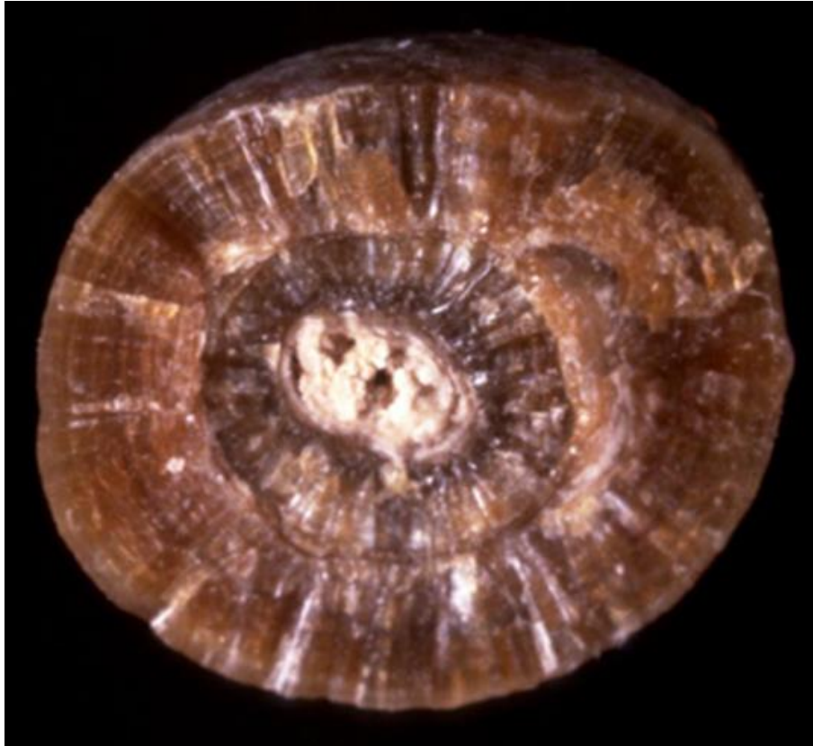
Fig. 6 Section of a whewellite stone exhibiting a whitish core made of carbapatite containing holes highly suggestive of Randall's plaque with calcified tubules

While endocytosis of CaP particles or secondary precipitation of CaP in the basement membrane of the cells may result from local high supersaturation, another phenomenon could explain why CaOx crystals may be secondary deposited on the CaP Randall's plaque after the papillary epithelium has been lost by a yet unexplained mechanism. Indeed, it is well known that CaP particles are the most frequent mineral phases found in urine [37]. In the case of low diuresis or high acid load, the secretion of H + in the distal part of the nephron results in a rapid decrease of the pH inducing dissolution of CaP particles. As a consequence, an increased calcium concentration may increase enough the CaOx supersaturation to induce nucleation of CaOx crystals that are excreted in the caliceal cavities [3, 38] and then may be fixed on the CaP particles at the surface of the papilla [26]. Then, the stone growth depends on the level of CaOx supersaturation, which is linked to the diuresis, and the concentration of both calcium and oxalate, and also of inhibitors such as citrate. When the stone is too large or too heavy for the mechanical resistance of the Randall's plaque that plaque may be disrupted and the stone free in the caliceal space. Thereafter, it may be rapidly spontaneously passed (the most frequent situation) or retained in the calyx.