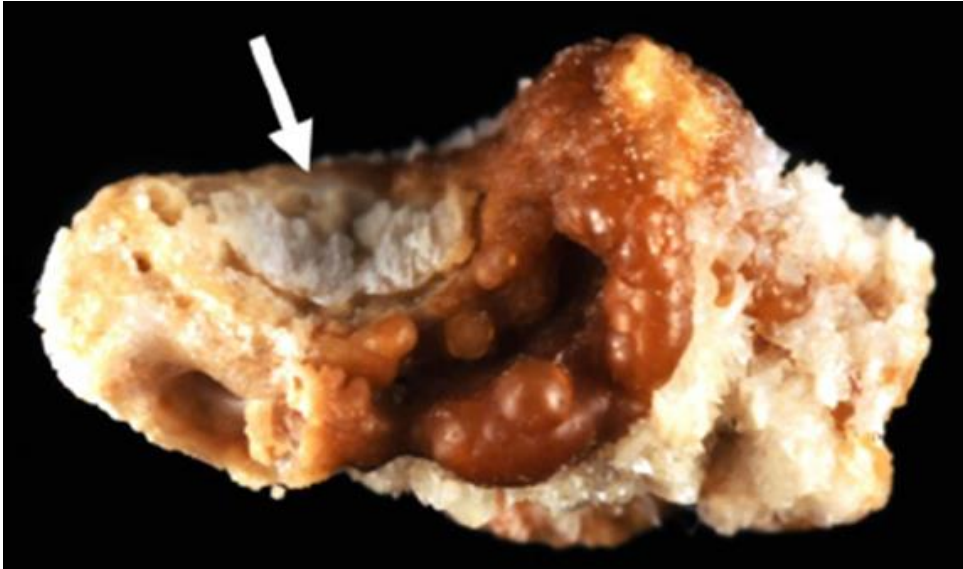
Fig. 4 Mixed stone made of whewellite and weddellite nucleated from a Randall's plaque (white arrow)

In our experience, based upon 45,774 calculi referred to the Necker hospital stone laboratory over the past three decades, we found by morphologic examination coupled with FTIR analysis that 8,916 (19.5 %) calculi exhibited a depressed surface (umbilication) suggestive of a papillary attachment [21]. Most of these stones (92.5 %) were made of CaOx monohydrate (whewellite) either pure (Fig. 3) or admixed with CaOx dihydrate (weddellite) as observed in Fig. 4. As previously reported, the composition of Randall's plaque is carboxapatite in 90 % of cases, but other crystalline phases may be found as main component of Randall's plaque such as amorphous calcium phosphate, brushite or whitlockite, or trioxypurines like sodium urate [19, 21].