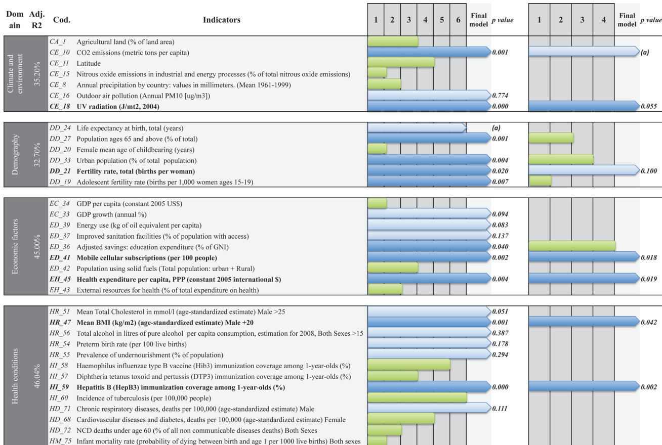
Fig 2. Stepwise identification of predictors of T1D incidence (a) by domain and (b) final. The lines are the 35/77 variables with p < 0.2 . Green bars indicate variables that were excluded during the stepwise multiple regression (the length of the bar indicates the number of steps at which it was excluded). Blue bars indicate that variables were selected after SMLR was applied. The dark blue bars indicate that the independent predictors of T1D were highly significant; panel (A): in the by-domain analysis; panel (B): in the final model. The final analysis was performed on the variables selected in the by-domain analysis (shown in dark blue in panel (A)). Abbreviations: Dom: Domain, PM: particular matter, UV: ultraviolet, GDP: Gross Domestic Product, BMI: Body Mass Index, CVD: Cardiovascular Diseases, CA: Cancer, DM: Diabetes Mellitus, CHRDR: Chronic Respiratory Diseases, Adj.R2: Adjusted-R2. (a) Variable dropped after applied Akaike information criterion (AIC).