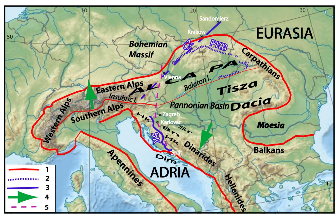
Figure 1. Geostructural frame of the Alpine belts in the Central Europe-Mediterranean region, showing present day location of the SKICZ (Split-Karlovac-Initial PKB-Crustal-Zone) segments of the paleotransform, drawn in blue colour: SK, Split-Karlovac; PKB: Pieniny Klippen Belt; CZ: Crustal Zone. Bn: Bosnian zone; Dlm: Dalmatian zone; Hk: High Karst zone; Sr: Serbian zone. 1: front of the Alpine belts; 2: Pieniny Klippen Belt (PKB); 3: SK and CZ end segments of the SKICZ paleotransform zone (dashed line in depth, full line Krakow-Sandomierz fault at surface); 4: vergence of obducted ophiolites; 5: the Split-Karlovac-Wien (SKW) line suggested in 1977 by Chorowicz.

The Pieniny Klippen Belt (PKB, Fig. 1) in the Northwestern Carpathians presently is a subvertical, narrow - up to 20km wide -, 600km long, strike-slip fault zone which separates the inner and the outer nappes (e.g., Golonka et al., 2015). The PKB emerges in the west from beneath the Neogene sediments of the Vienna basin and ends to the east against the eastern alongstrike continuation of the Balaton line. The 'black flysch', which crops out along the eastern continuation of the Balaton line, may belong to the PKB (e.g., Schmid et al, 2008). The Inner Northwest Carpathians, in between the Balaton line and the PKB, were compressed during the Late Paleogene-Neogene together with the Inner Southeast Carpathians composed of the Tisza and Dacia units (Fig.1). This compression pushed the Outer Carpathian flysch nappes onto the Miocene deposits of the Carpathian foredeep that covers the Eurasia platform (e.g., Csontos and Vörös, 2004; Săndulescu, 1975).