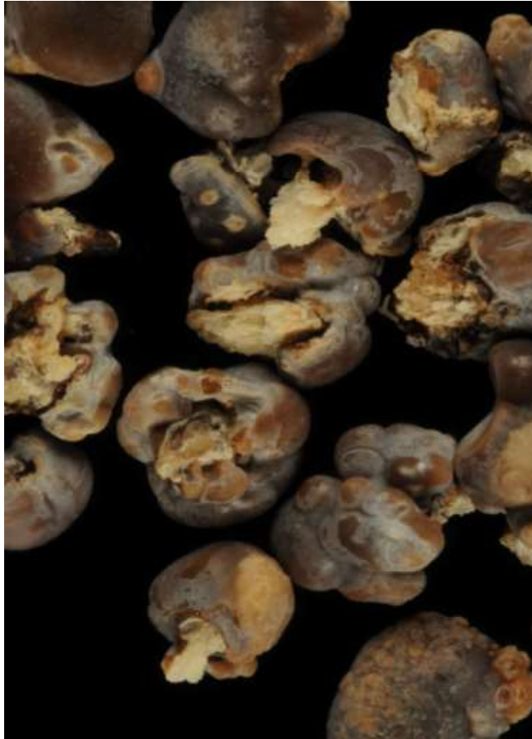
Figure 1: Typical monohydrate calcium oxalate stones (type Ia, brown structures) harbouring papillary umbilication and Randall's plaque made of apatite (white structures).

Alexander Randall, an American urologist, proposed in 1936 a new theory relative to “The origin and growth of renal calculi” [1,2]. Based upon extensive forensic studies performed between 1935 and 1938, he observed, at the tip of renal papillae, lesions consisting of calcium phosphate and carbonate deposits accumulating in kidney interstitium.