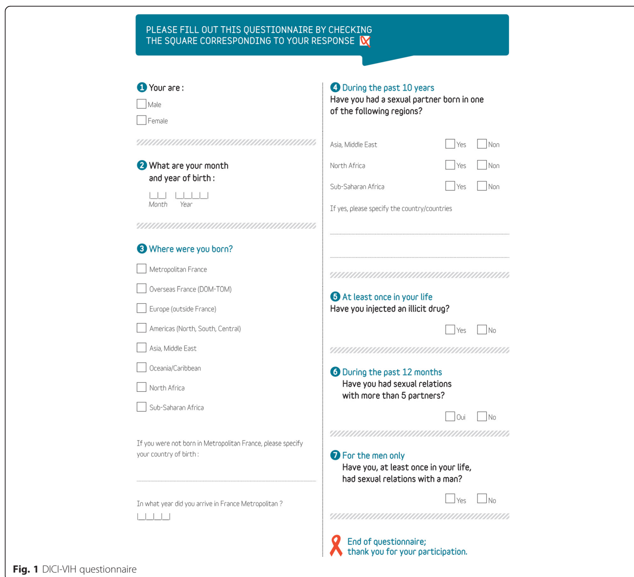
Fig. 1 DICI-VIH questionnaire