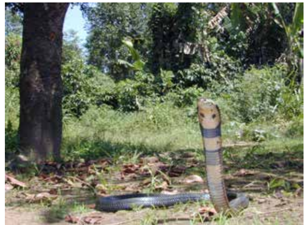
Fig. 20. Naja melanoleuca . Cameroon, Bamessing, October 31, 2003.

The validity of this family was recently demonstrated by Kelly et al. (2011). This work showed that the genus Lamprophis was polyphyletic. A new genus was created and other species previously included in the genus Lamprophis were divided into three groups: (1) virgatus and fuliginosus , together with lineatus and olivaceus were transferred to the revalidated genus Boaedon A.M.C. Duméril, Bibron, and A.H.A. Duméril, 1854; (2) Lycodonomorphus was nestled within Lamprophis sensu lato and a sister taxon of Lamprophis inornatus —the latter species was therefore transferred to the genus Lycodonomorphus ; (3) Lamprophis sensu stricto was restricted to a small clade of four species endemic to South Africa, with Lamprophis aurora as type species. We follow this revised taxonomy here.