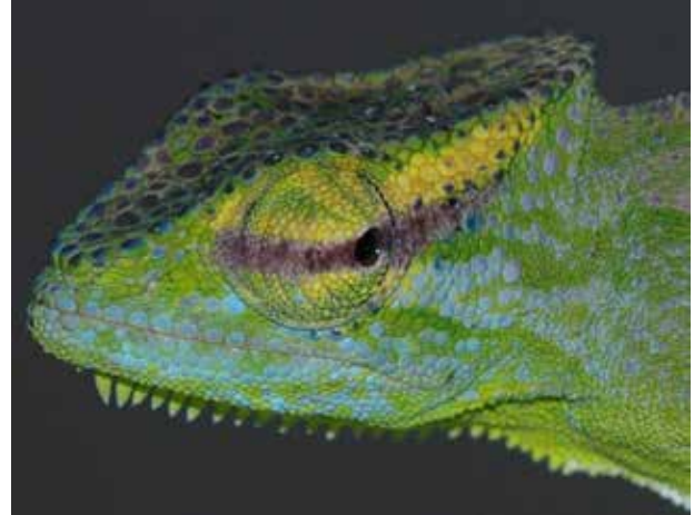
Fig. 13. Individuals assigned to T. serratus altitude populations (top, Elak Oku village; MNHN-RA 2007.1463) differ from those from lower altitudes like here (bottom) the neotype of T. serratus (MNHN-RA 2007.1494) by some important scalation and coloring characters.