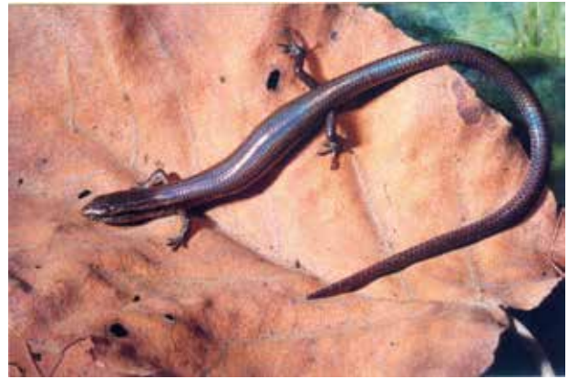
Fig. 17. Leptosiphos vigintiserierum . Cameroon, Mt. Mekua, Bamboutos. Specimen CamHerp 36431. March 12, 2002.

ember 14, 2002 [1938]) – MNHN-RA 2005.1944 (Veko village, 6.139°N and 10.578°E, elev. 2,044 m, coll. CamHerp M. LeBreton and L. Chirio, December 14, 2002) – MNHN-RA 2005.1958-1959 (two specimens, Sarkong Hill, west of Jakiri, 6.054°N and 10.598°E, elev. 1,600 m, coll. CamHerp, March 19, 2002) – MNHN-RA 2005.2484 (Tefo village, 6.30°N and 10.37°E, elev. 1,700 m, coll. CamHerp M. LeBreton and L. Chirio, July 8, 2002).