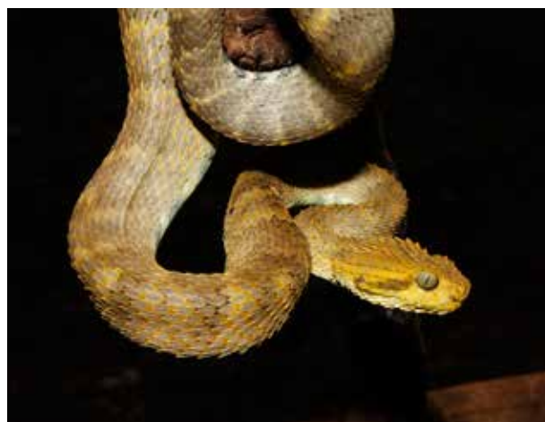
Fig. 21. Atheris broadleyi . Megangme, 4.598°N and 12.225°E, elev. 610 m, September 8, 2012.

This big forest viper was reported from Bafut (elev. 1,200 m, 6.08°N and 10.10°E) by Stucky-Stirn (1979) and found at 1,500 m in the western extension of the BH, and also at Mende in the Takamanda. It was observed by one of us (LC) at almost 1,500 m near Bangangte. In Cameroon it is found at altitudes between 5 m and only