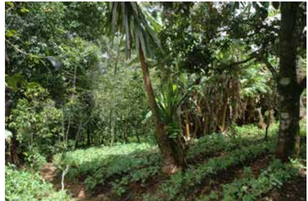
Fig. 8. Associated crops (beans, coffee, bananas, corn) encountered near villages (here around Elak Oku village) are not completely adverse to chameleons when a large plant and shrub cover is maintained. Picture: I. Ineich, May 8, 2007.

2005.2736 (three specimens, Awing village (Benjom), 5.867°N and 10.266°E, elev. 1,747 m, coll. CamHerp M. LeBreton and L. Chirio, December 14, 2002) – MNHN-RA 2005.2735 (Awing village (Benjom), 5.867°N and 10.266°E, elev. 1,747 m, coll. CamHerp M. LeBreton and L. Chirio, July 8, 2002) – MNHN-RA 2005.2737 (Baba II village, 5.857°N and 10.102°E, elev. 1,772 m, coll. CamHerp M. LeBreton and L. Chirio, December 14, 2002) – MNHN-RA 2005.2738-2744 (seven specimens, Baba II village, 5.857°N and 10.102°E, elev. 1,772 m, coll. CamHerp M. LeBreton and L. Chirio, July 8, 2002 [MNHN-RA 2005.2739, .2741 and .2743: December 14, 2002]) – MNHN-RA 2005.2745 (Bamboutos, Mt. Mekua, 5.688°N and 10.095°E, elev. 2,700 m, coll. CamHerp L. Chirio, March 30, 2000) – MNHN-RA 2005.2748 (Bingo village, 6.166°N and 10.290°E, elev. 1,435 m, coll. CamHerp M. LeBreton and L. Chirio, December 14, 2002) – MNHN-RA 2005.2749-2752 (four specimens, Mt. Oku, Elak Oku village, 6.202°N and 10.505°E, elev. 2,000 m, coll. CamHerp M. LeBreton and L. Chirio, July 8, 2002) – MNHN-RA 2005.2755-2759 (five specimens, Mbiame, 6.190°N and 10.849°E, elev. 1,955 m, coll. CamHerp M. LeBreton and L. Chirio, July 8, 2002 [MNHN-RA 2005.2758-2759: December 14, 2002]) – MNHN-RA 2005.2760-2761 (two specimens, Mbockghas, elev. 2,092 m, coll. CamHerp M.