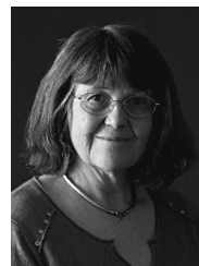
several Academic Networks concerning research on disability.