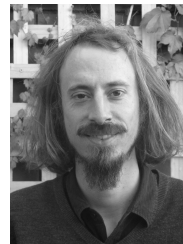
Postdoctoral Research Fellow at The University of Melbourne.