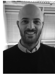
motor control learning. His research interests include physical Human-Robot Interaction, rehabilitation robotics, biomimetic systems, and haptics.