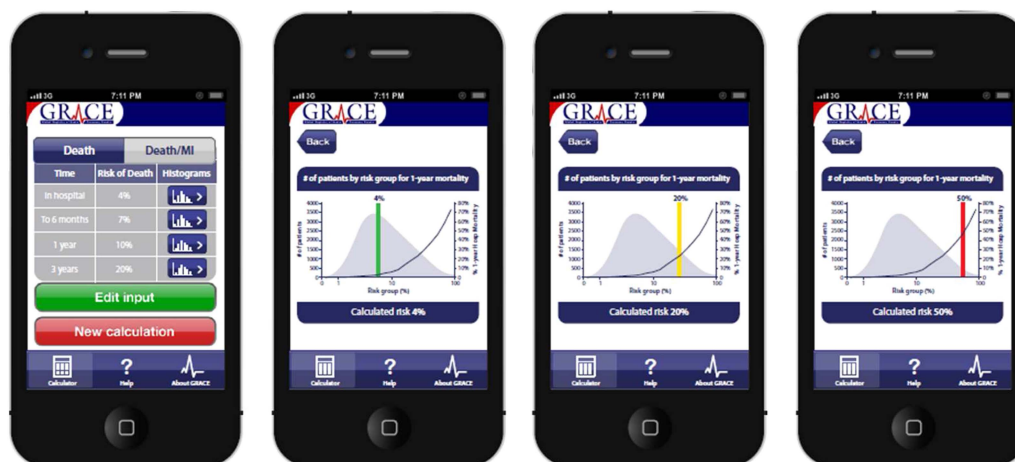
Figure 2 Illustration of the Global Registry of Acute Coronary Events (GRACE) Score 2.0 on a mobile device (suitable for use in iOS, android or web versions). Left panel: values for percentage risk of death or death/myocardial infarction (or numerical GRACE Score). Remaining panels show the individual patient results as a vertical column superimposed on the entire acute coronary syndrome distribution curve (green column=low risk illustration, yellow column=medium risk and red column=high risk). 34 For further information see http://www.gracescore.co.uk and http://www.outcomes.org/grace .

Recognising that population characteristics may differ in comparison with that of the originally derived GRACE model, we employed the most recent GRACE dataset in this study and externally validated the risk model in an entirely separate dataset (FAST-MI 2005 with yearly follow-up to 2010). We have previously reported that the GRACE risk prediction is not subject to significant change over time. 33 The purpose of providing 1 and 3-year risk estimates was to aid the clinician regarding secondary prevention. 34 The risk prediction estimates at 3 years were consistent with those at 1 year (although the 3-year data derive from a smaller dataset).