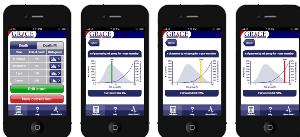
Figure 2 Illustration of the Global Registry of Acute Coronary Events (GRACE) Score 2.0 on a mobile device (suitable for use in iOS, android or web versions). Left panel: values for percentage risk of death or death/myocardial infarction (or numerical GRACE Score). Remaining panels show the individual patient results as a vertical column superimposed on the entire acute coronary syndrome distribution curve (green column=low risk illustration, yellow column=medium risk and red column=high risk). 34 For further information see http://www.gracescore.co.uk and http://www.outcomes.org/grace .

Recognising that population characteristics may differ in comparison with that of the originally derived GRACE model, we employed the most recent GRACE dataset in this study and externally validated the risk model in an entirely separate dataset (FAST-MI 2005 with yearly follow-up to 2010). We have previously reported that the GRACE risk prediction is not subject to significant change over time. 33 The purpose of providing 1 and 3-year risk estimates was to aid the clinician regarding secondary prevention. 34 The risk prediction estimates at 3 years were consistent with those at 1 year (although the 3-year data derive from a smaller dataset).