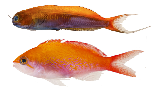
Figure 3: (b) Pseudanthias regalis and (a) its mimic Ecsenius midas.

relationships between multiple species). Because this complex mimicry case was only discovered from photographs rather than in–situ observations, the function of the complex is unknown. Stethojulis marquesensis may display this colour as a cleaning signal or for protective mimicry as cleaner species are less vulnerable to predation.