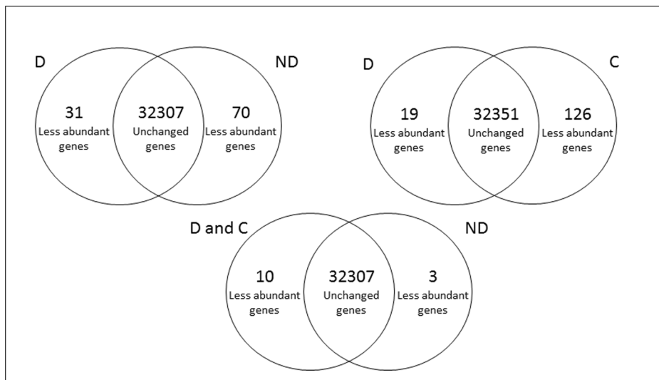
Figure 2. Number of genes with altered expression during after-ripening ( \geq 2 -fold; p < 0.05 ). Change in gene transcript abundance between dormant (D), after-ripened control (C) and non-dormant (ND) seeds. doi:10.1371/journal.pone.0086442.g002

macromolecules [11]. It has been shown that the shift from dormant to non-dormant state occurs within the range of 0.04–0.2 g H 2 O g DW -1 [23,24]. Based on sorption isotherm curve, such range of MC corresponds to weakly bound water [24]. These conditions do not allow biochemical reactions such as gene transcription and translation [4]. However, transcript variation has been reported during dry after-ripening [5,6,7,8]. In this paper, we have used an after-ripening control to distinguish between storage associated- and dormancy alleviation specific- in gene transcription variation.