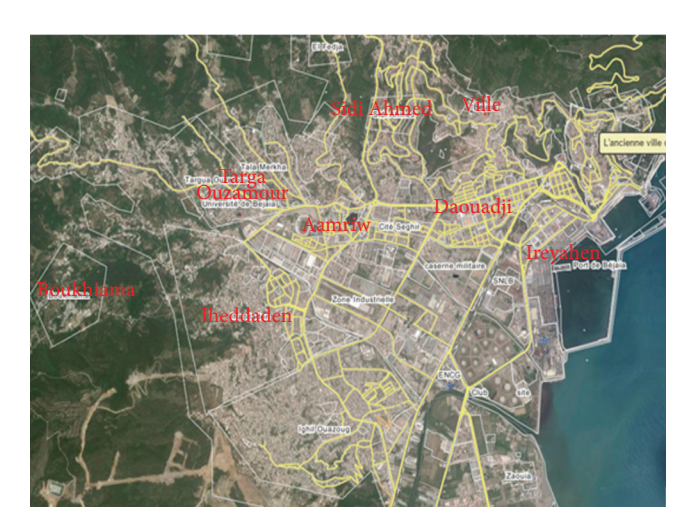
FIGURE 1: Bejaia: map of sampling sites.

2.2. PM_{10} Assessments. Due to lack of data on the quality of outdoor air in Bejaia, we chose to make by ourselves ad hoc outdoor pollution measurements. These measurements were performed for 4 months (04/08/2015 to 07/14/2015), this period coinciding with atmospheric stagnant conditions. In their study, Alkama et al. [34], studying seasonal variations of air pollution (CO, NO, and SO_2 ), showed that measured concentrations are strongly correlated with industrial activity and heavy traffic in this city: maximum values were observed in the summer period, while minimum values were measured