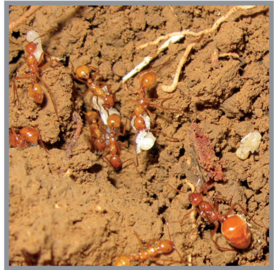
Fig. 1. Comparison of ergatoid queen (bottom right corner) and workers in M. foreli , showing the large difference in gaster size.

Three M. foreli colonies were excavated from within a large wet log (RMMA110324-03: workers = 226; brood, excluding eggs = 130; zero males; one ergatoid queen), at the base of a Pourouma tree (RMMA110323-01: workers = 455; brood, excluding eggs = 219; zero males; one ergatoid queen), and at the base of a small plant (RMMA110323-05: workers = 2,231; brood, excluding eggs = 134; 64 males; one ergatoid queen). Queens were strikingly distinct from workers due to their big gasters (Fig. 1). The M. wallacei ergatoid queens were much less conspicuous with a gaster only slightly larger than workers, consistent with other reports (Boudinot et al. 2013). Up to six ergatoid M. wallacei queens occurred together with 110 \pm 88 workers and brood ( n = 12 ). In both species, the queen's thorax was highly reduced, consistent with their ergatoid nature. Distinct ocelli typical of flying queens, were not observed in