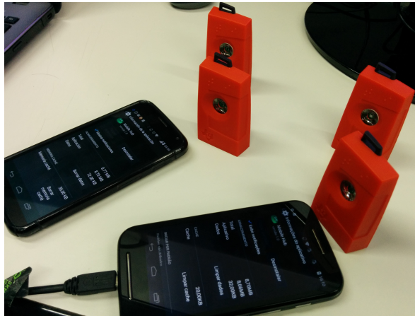
Fig. 3. ContextNet Mobile Hub with four SensorTags

tasks. These are defined as generalizations and associations and through attributes that may reference events. Their abstractions are suitable for specification but cannot be computed efficiently. On the other hand, the work [9] describes a system (ETALIS) that can perform reasoning over streaming events with respect to background knowledge, similar to our Knowledge Base. It implements two languages for specification of event patterns: the rule based ETALIS Language for Events (ELA), and Event Processing SPARQL. ETALIS can evaluate domain knowledge on-the-fly, thereby proving semantic relations among events and reasoning about them. Their semantic relations among events are time-based, but don't have the synchronicity requirement. Another difference is that they do not generate a RDF Stream which they check against a knowledge base. Thus, their inference is much simpler than the one proposed in our project.