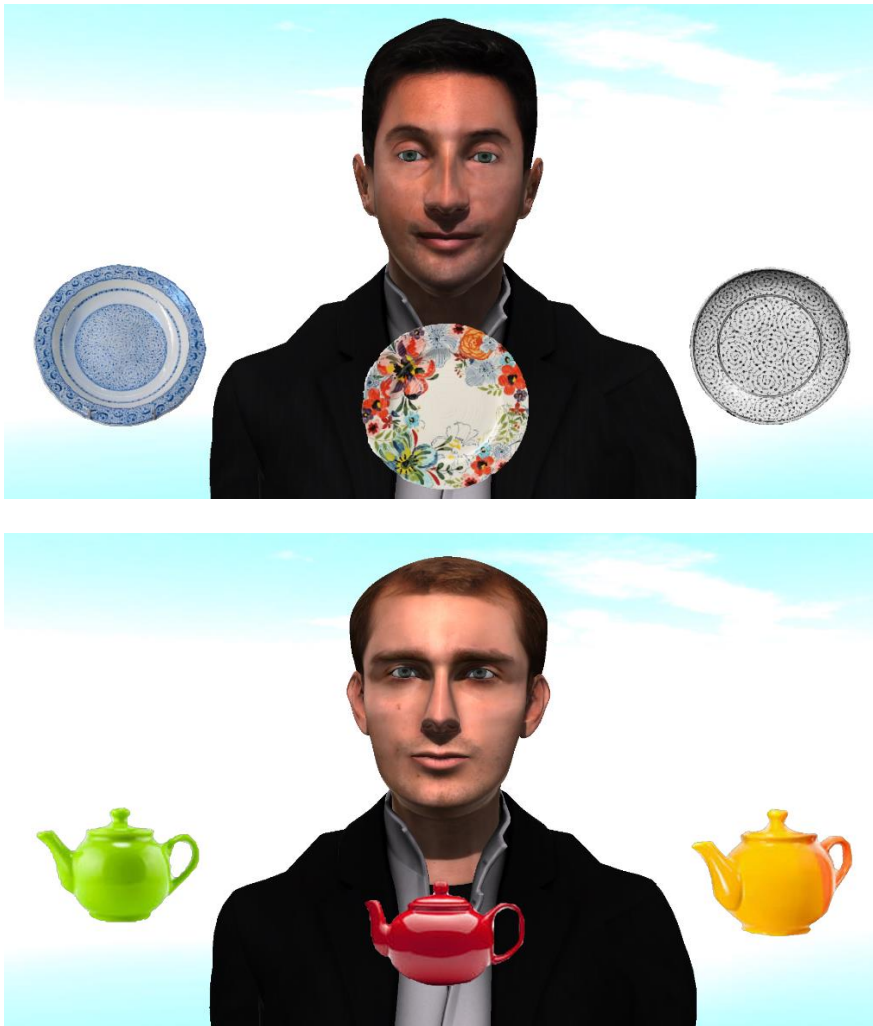
Figure 1: Snapshots of the virtual scenes presented to the participants. Each scene displayed an avatar surrounded by three objects. The two avatars that were compared were named Antony (above) and Mathew (below).