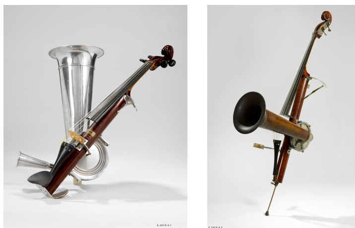
Figure 2: A violin (E.996.10.1, Collection of Musée de la Musique – Paris [13]) and a cello (E.2010.4.3) made by Augustus Stroh, after his patent n° 9418 “Improvements in Violins and other Stringed Instrument”, filed 4 May 1899 and registered 24 March 1900.

The singular Stroh instruments are hard to classify. Instantaneously categorised as “violin-like instrument” in a listening test, these instruments seem however “half- string, half-wind” instrument (Figure 2). A scientific documentation resulting from a pluridisciplinary collaboration (acousticians, curators, musicians) shows that what could be considered as just curious instruments actually appear to be the work of a talented maker, resulting from the process of the engineer Augustus Stroh to meet his original need, i.e. solving part of the difficulties of the sound recording techniques in their infancy [15]. By shedding light on its genesis and history, and explaining their acoustical functioning, this scientific documentation give these instruments a new place in the instrumentarium and make them integral musical instruments. In this sense, this documentation can disrupt the values likely to be conveyed by the instruments and modify their perception by spectators.