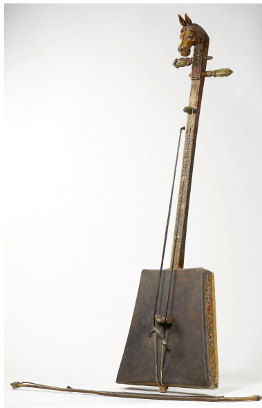
Figure 5: Viele morin huur (E.2009 2.1, Collection of Musée de la Musique – Paris [13]).

the existence of the object itself, these studies will allow this instrument to be the vehicle and the survival tool of an oral culture in movement.