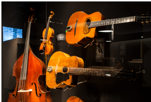
Figure 3: A “big mouth” Selmer-Maccaferri guitar at the top and a “small mouth” Selmer jazz guitar below, as presented during the Django Reinhardt exhibition at Musée de la Musique in 2012.

These obvious organological differences would normally foreshadow a sound contrast between the two instruments. However, acoustical analyses contradict this assumption. The global responses of both instruments appear similar: the spectral analysis presented in Figure 4 shows a similar distribution of the radiated energy as a function of frequency, mainly spread between 200 and 400 Hz (band 2). The measured differences between the two guitars are of the same order of magnitude as the differences between guitars of the same model.