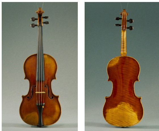
Figure 1: Violin made by Nicolas Lupot (E.996.10.1, Collection of Musée de la Musique – Paris [13]). Sometimes called “The French Stradivari”, Lupot was very active in Paris at the beginning of the 19th century. His instruments are largely inspired by Stradivarius models, which he was able to access thanks to his reputation as a repairer. The label inside the violin reads “Nicolas Lupot luthier rue de Grammont à Paris l’an 1803”. Its neck was changed at least once and its set-up is typical of the first half of the 20th century, as indicated by its “Émile Français Paris” iron-stamped bridge.

the opening ceremony of the new museum in 1995. A few years later in 2002, the same violin allowed to hear the piece for solo violin written by Iannis Xenakis in 1950, in a tribute concert to this composer. From which period really is this instrument? Is it even from a precise period? What is the real signification of the manufacture year still visible on the authentic maker's tag inside the instrument? What do we hear in each concert: a violin from 1995 or 2002, date of the concerts? An instrument from 1720 or 1950, dates of the creation of the pieces? Or an instrument from 1803 which has the incredible capability of being used for both music written way before and way after its fabrication?