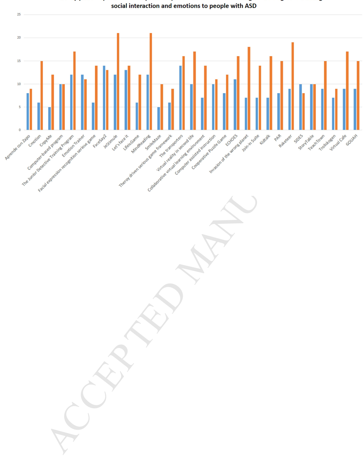
Connolly (max=15) and Vusoff (Max =24) scale total scores according to the 31 games training