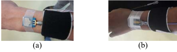
Fig. 1. Antennas on left wrist (a) SkyCross at h_T = 0 mm on test subject 1 (b) 60 GHz SIW horn antenna at h_T = 5 mm above test subject 2 skin.