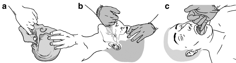
Fig. 2 a, b, c Intraoral myofascial therapy of the sphenopalatine ganglion. Position of the patient's head and the osteopath's fifth finger, during SPG release

Evaluation of lacrimation induced by AM and SM was performed using Schirmer's test according to a validated method [27] during administration of AM and SM. Schirmer's test consists of placing a calibrated strip of blotting paper in the lower conjunctival fornix of both eyes to absorb tears, and then measuring the length of moistened blotting paper. Strips of blotting paper were