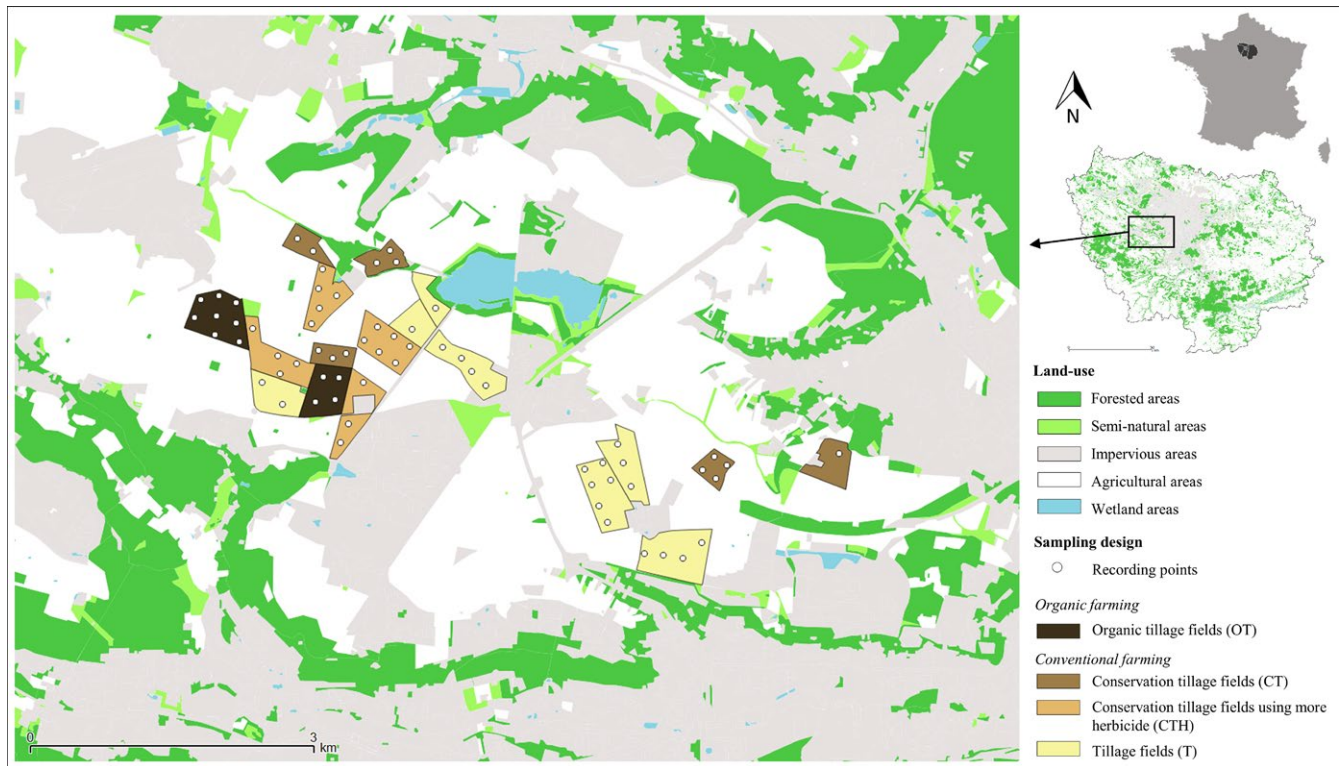
FIGURE 1 Land-use map of the study area showing sampling sites inside wheat fields of the four studied farming systems (OT, organic tillage fields; CT, conservation tillage fields; CTH, conservation tillage fields using more herbicide; T, tillage fields)

chosen in order to limit differences in surrounding land-use in the studied farming systems (Figure S2.1).