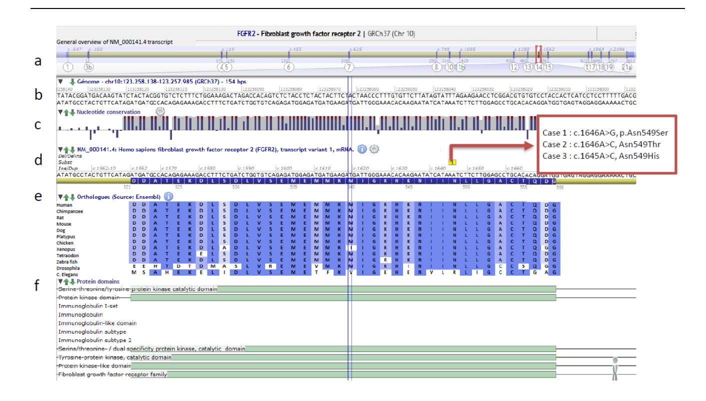
Figure 2. Localization of mutations in FGFR2 exon 14, coding for FGFR2 tyrosine kinase 1 domain (Alamut Visual Interactive Biosoftware, France). a) general overview of Humo Sapiens FGFR2 (NM_000141.4) transcript, composed of 18 exons with genomic numbering, exon 14 is shown in red brackets; b) exon 14 genomic localization; c) nucleotide conservation; d) amino-acid positions: the mutations localizations for the three cases are shown in yellow (red arrow); e) amino-acid conservation among different species: the mutations are located in highly conserved nucleotides; f) exon 14 transcript, this exon codes for tyrosine kinase domain.

Patient 2 is a fifteen-year-old girl presenting with exorbitism, maxillary retrusion, and broad thumbs that corresponds to Pfeiffer syndrome. Parents have a normal appearance and further family history is unknown. Pregnancy was uneventful. She was born with coronal fusion, then developed premature sagittal fusion. Ventriculoperitoneal shunt was placed at the age of six weeks for hydrocephalus, and was removed at ten. She underwent bilateral parietal decompression at the age of four and ten, posterior decompression with distractors at thirteen. Ophthalmological examination revealed strabismus, which was treated surgically, and right ptosis. Neurological imaging shows Chiari malformation, which was operated at the age of five, complicated with cervical C3-C7 syrinx, and no intracranial malformation. Clinical examination shows unilateral hypoacousia, upper limbs paresthesias and lower limbs weakness that progressively got better after occipital foramen surgery. She presents behavioral abnormalities treated with ritaline but no major intellectual disability. She has sleep apnea syndrome, which required CPAP therapy at night for years and resolved after tonsillectomy.