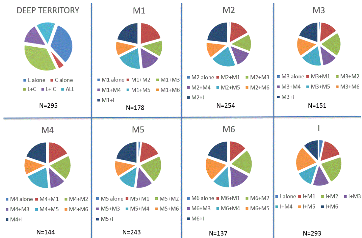
Supplementary Table II. Proportion of DWI reversal in the entire cohort and in left- and right- sided strokes.

The total number of patients was 382 (patients with pre-treatment and follow up MRI). The p-value refers to the comparison between the proportion of DWI reversal between right and left sided strokes.