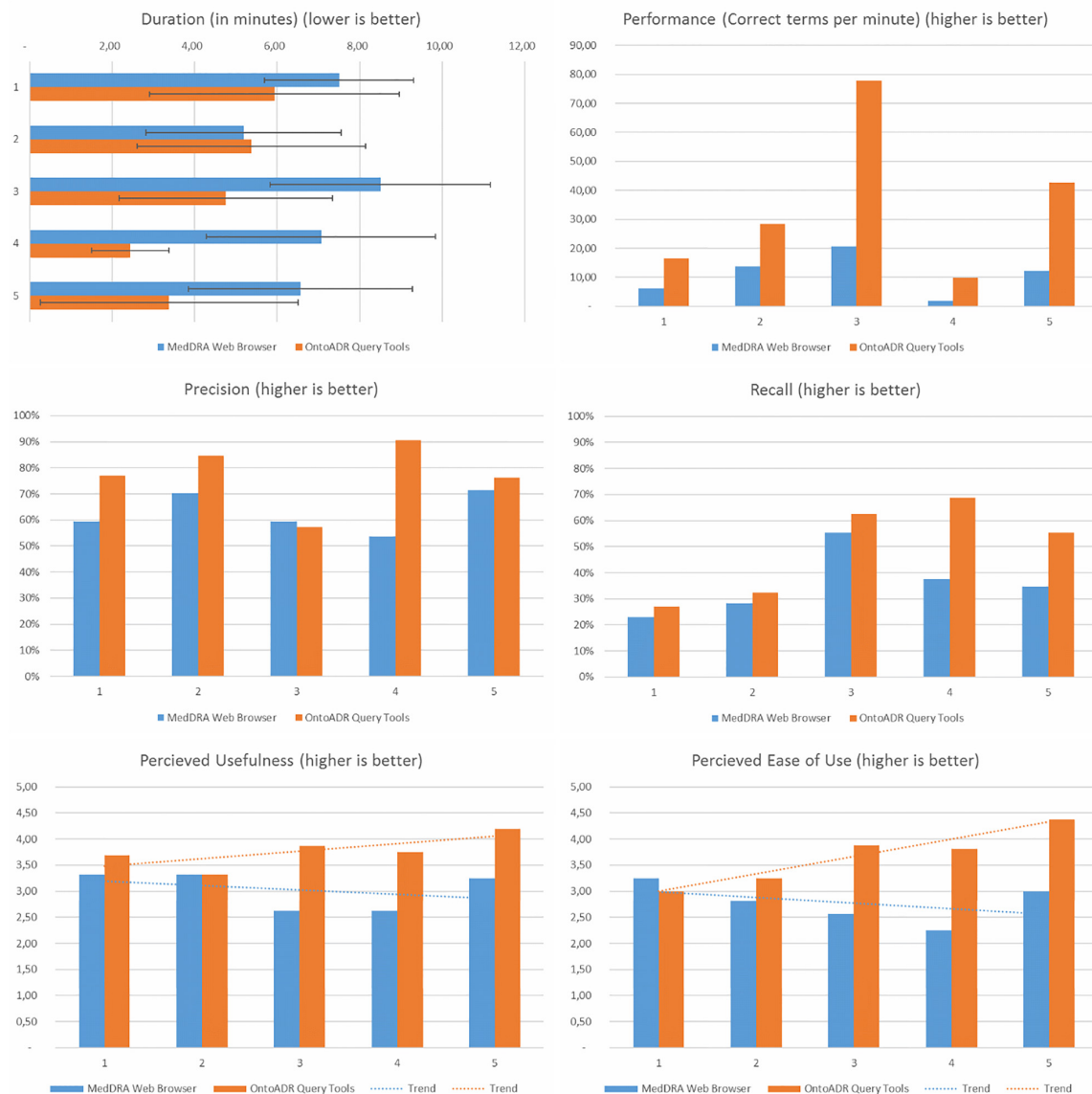
FIGURE 3 | Barcharts showing measures of duration, performance, precision, recall, perceived usefulness, and perceived ease of use for the five safety topics.

time dealing with these elements, significantly speeding up the calculation process.