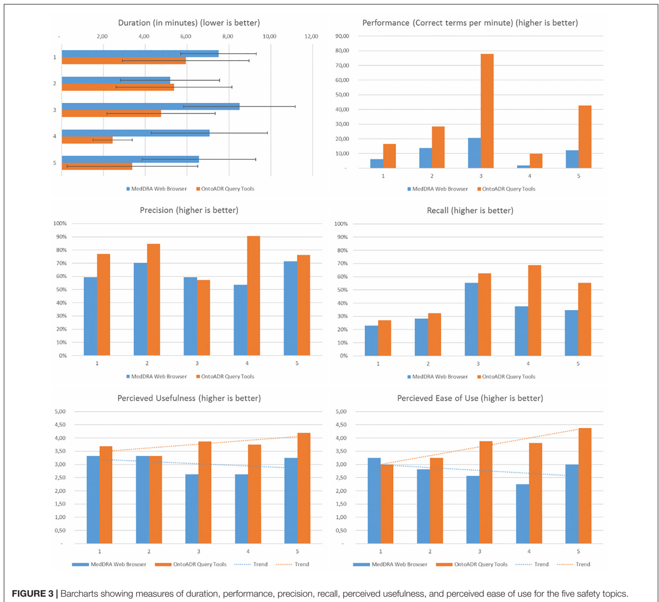
FIGURE 3 | Barcharts showing measures of duration, performance, precision, recall, perceived usefulness, and perceived ease of use for the five safety topics.

time dealing with these elements, significantly speeding up the calculation process.