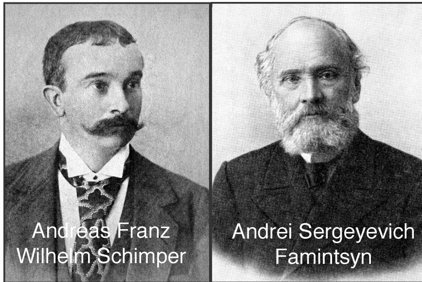
Fig 2. Neglected pioneers of the theory of the endosymbiotic origin of chloroplasts: Andrea Franz Wilhelm Schimper and Andrei Sergeyeovich Famintsyn.

was proposing cyanobacteria as a symbionts based simply on the relatively simple structural characteristics of cyanobacteria. It seems rather unjust then that, since 2009, Merezhkowsky 1905 has been cited 123 times compared to Schimper 1883 cited but 37 times and Famintzin not cited at all. In place of a portrait of the criminal Merezhkowsky, Figure 2 shows two of the relatively neglected pioneers of the endosymbiotic theory of the origin of the chloroplast: Andreas Franz Wilhelm Schimper and Andrei Sergeyeovich Famintsyn.