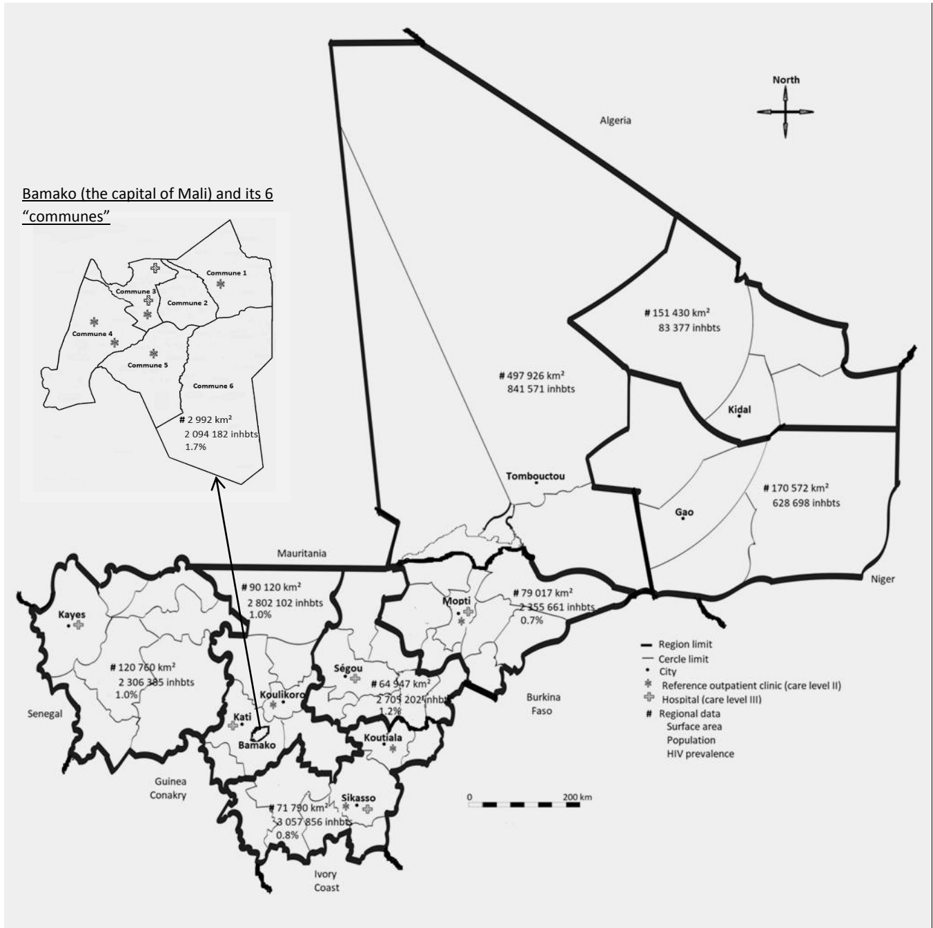
Supplementary figure 1. Map of Mali and its capital (Bamako), showing the location of the study care centres*

Abbreviations: Inhbts, inhabitants; km 2 , square kilometres