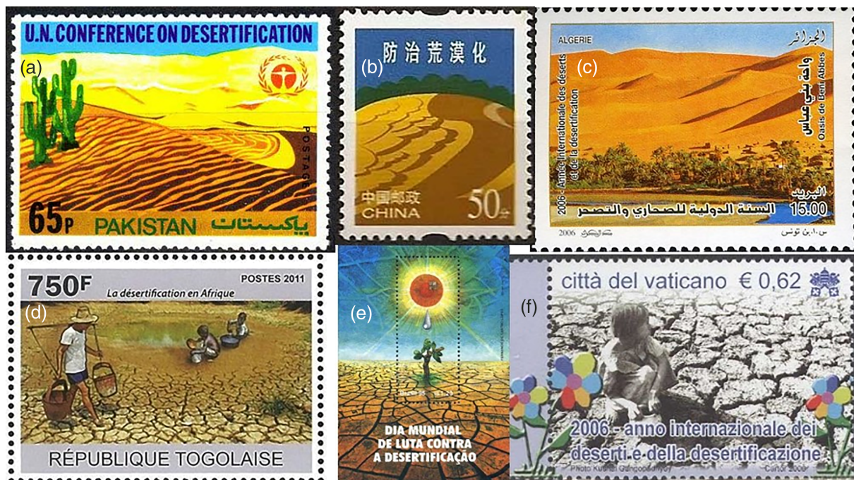
FIGURE 2 Postage stamps intended to draw attention to desertification and associated events, which illustrate the common misunderstanding of the nature of desertification. That is, the (a–c) spreading desert and (d–f) cracked soils (Toth & Hillger, 2012) [Colour figure can be viewed at wileyonlinelibrary.com ]

Although sand movement does occur under the action of wind, dunes encroaching on cultivated land and settlements as a result of human actions is a minor phenomenon (Bellefontaine et al., 2011). In China, where degradation by sand movement (‘sandification’) is a major problem, only 5.5% is said to be caused by encroachment at the edges of existing dunes and sand sheets (Wang, 2004). Damage caused by inappropriate tillage practices, overgrazing by livestock,