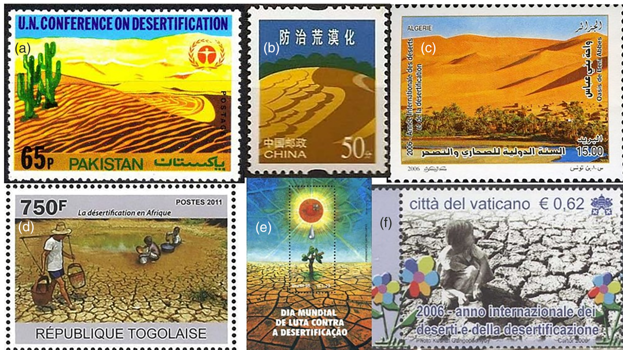
FIGURE 2 Postage stamps intended to draw attention to desertification and associated events, which illustrate the common misunderstanding of the nature of desertification. That is, the (a–c) spreading desert and (d–f) cracked soils (Toth & Hillger, 2012) [Colour figure can be viewed at wileyonlinelibrary.com ]

Although sand movement does occur under the action of wind, dunes encroaching on cultivated land and settlements as a result of human actions is a minor phenomenon (Bellefontaine et al., 2011). In China, where degradation by sand movement (‘sandification’) is a major problem, only 5.5% is said to be caused by encroachment at the edges of existing dunes and sand sheets (Wang, 2004). Damage caused by inappropriate tillage practices, overgrazing by livestock,