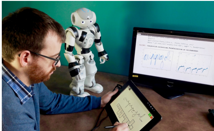
Fig. 1: A use case example of the CoWriter robot: the user teaches the robot how to write.

The main elements of this learning-by-teaching scenario are the robot and the tablet. This last one is used to collect handwriting samples from users, as well as to present handwriting feedback. It is possible to speculate about the importance of the presence of the robot and its ability on stimulating concentration and engagement. The experiment reported in this paper explores the role in this scenario of such agent, comparing users performances in three different conditions: handwriting sessions with the CoWriter robot; handwriting sessions with a virtual agent; handwriting session with the tablet only, guided by a voice. The hypothesis is that the social robot would be able to elicit an higher attention than the virtual agent or the vocal guide.