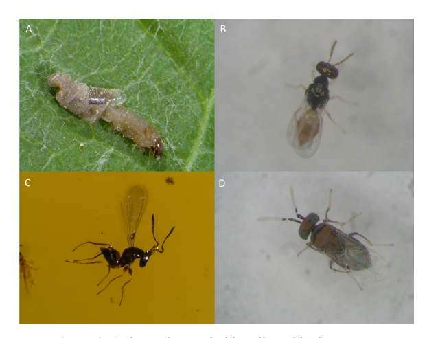
Figure 3. Arthropods parasitoids collected in the Douro Demarcated Region: Elachertus sp. (Eulophidae) parasitizing a larva of Lobesia botrana (A); adult of Elachertus sp. (B); adult of Mymaridae, an important parasitoid of Empoasca vitis (C); adult of Anagyrus sp. nr. pseudococci (Encyrtidae), an important parasitoid of Planococcus ficus (D).

Several families of parasitoids were captured in traps or observed by visual inspection, namely Aphelinidae, Braconidae, Chalcididae, Encyrtidae, Eulophidae, Ichneumonidae, Mymaridae, Platygastridae, and Pteromalidae (Carlos, 2017). These families include species which are important for the natural control of pests like L. botrana, E. vitis, and P. ficus. Thus, Elachertus sp. (Eulophidae) (Figure 3A and B), Campoplex capitator (Ichneumonidae), Brachymeria tibialis (Chalcididae), and Dibrachys cavus (Pteromalidae) were found to be important parasitoids of L. botrana (Carlos et al., 2013c; Carlos, 2017). On the other hand, egg parasitoids from the Mymaridae family (Figure 3C), in particular Anagrus atomus, are considered the most important natural enemies of E. vitis (Pavan and Picotti, 2009). Moreover, Anagyrus sp. nr. (Encyrtidae) (Figure 3D) were pseudococci frequently found parasitizing P. ficus (Sharma et al., 2018), and the females of this species, which are attracted to the sex pheromone of P. ficus (Franco et al. 2008), were observed in pheromone sticky traps used to monitor P. ficus males (Gonçalves et al., 2014c).