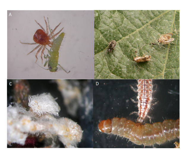
Figure 2. Predatory arthropods collected in the Douro Demarcated Region: Anystidae preying an Empoasca vitis nymph (A); Nigma sp. (Araneae: Dictynidae) preying adults of Lobesia botrana (B); larvae of Scymnus sp. (Coccinellidae) feeding on eggs and nymphs of Planococcus ficus (C); larva of Chrysoperla carnea sl. (Chrysopidae) preying a larvae of L. botrana (D).

fungi; some prostigmatids can live on other animals as parasites (reviewed by Gonçalves et al. , 2018b). In Prostigmata, it is also frequent to find mites from Anystidae (Figure 2A) and Erythraeidae, respectively predating or parasitizing nymphs of Cicadellidae (Carlos, unpublished data).