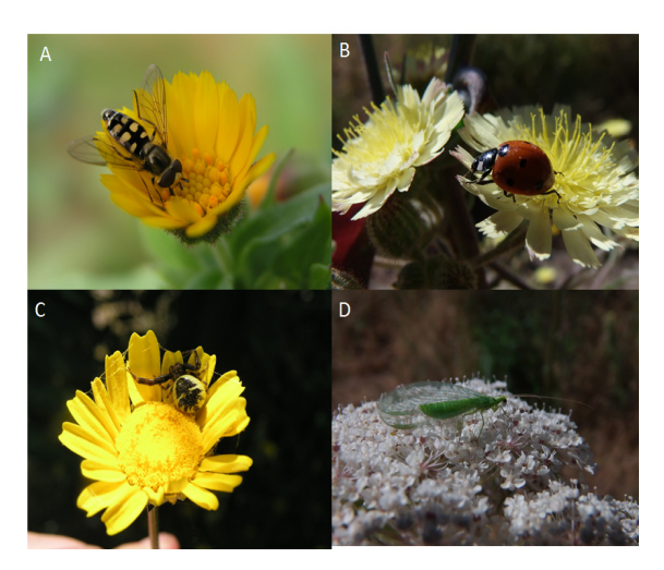
Figure 7. Predators frequently found in vineyard ecosystems; Eupeodes corollae (Syrphidae) (A), Coccinella septempunctata (Coccinellidae) (B) Synema cf. globosum (Araneae) in Asteraceae, and Chrysoperla sp. in Apiaceae (D).

In the DDR, the vegetation present in the horizontal alleys and embankments of the terraces was found to have particularly benefitted Araneae (in the predators) and Hymenoptera parasitoids (Carlos, 2017). The abundance and richness of predators in the soil (mainly Araneae and Carabidae) was positively correlated with the percentage of ground cover and the richness of plants (Gonçalves et al. , 2018a).