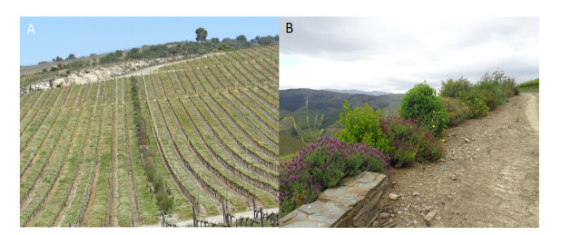
Figure 5. Examples of hedgerows installed in the Douro Demarcated Region: between plots of vineyards (A) or along roadsides (B). Authorship: C. Carlos/ ADVID

The plantation of shrubs in unproductive areas, like those between plots (Figure 5A) or along roadsides (Figure 5B), should be considered. Such plants do not interfere with the crop and provide necessary resources for natural enemies during the periods when the flowers of the crop or ground cover are not present, thus enabling to maintenance of high populations of those arthropods (Rodriguez-Saona et al. , 2012). For this propose, there might be an interest in the plantation of Viburnum tinus , C. albidus , C. ladanifer , C. salvifolius , L. stoechas , Lonicera spp., and T. mastichina , which are plant species adapted to the DDR edaphic and climatic conditions.