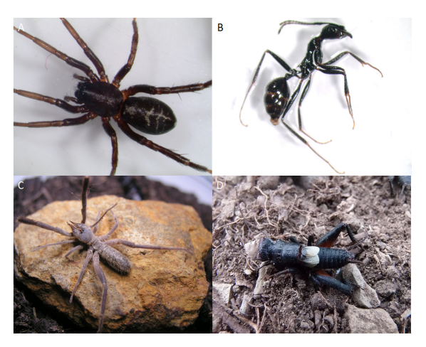
Figure 1. Arthropods endemic of the Iberian Peninsula, collected in the Douro Demarcated Region: Castianeira badia (Araneae: Corinnidae) (A), Aphaenogaster iberica (Formicidae) (B), Gluvia dorsalis (Solifugae) (C), and Sciobia lusitanica (Gryllidae) (D).