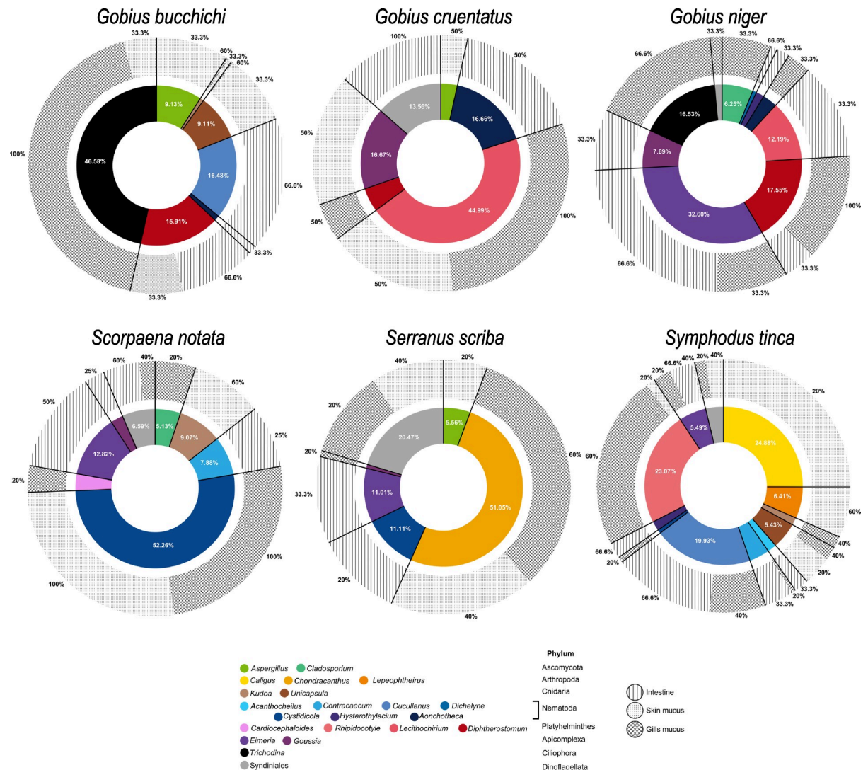
Fig 2. Eukaryotic parasitic community structure and distribution of each parasitic taxa within skin mucus, gill mucus and intestine for the fish family Sparidae. Percentages of parasitic taxa are indicated for proportions greater than 5%. Prevalence (proportion of individuals infected by a parasite taxa) is provided as a percentage around the outer circle.

https://doi.org/10.1371/journal.pone.0221475.g002