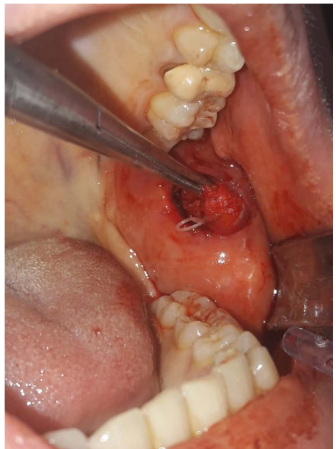
Figure 1. Per-operative photo of the removal of the worm ( Dirofilaria (Nochtiella) repens Railliet & Henry, 1911) from a sub-mucosal nodule in the cheek.

The blood count showed no eosinophilia, nor inflammatory syndrome. Filariasis serologies were inconclusive.