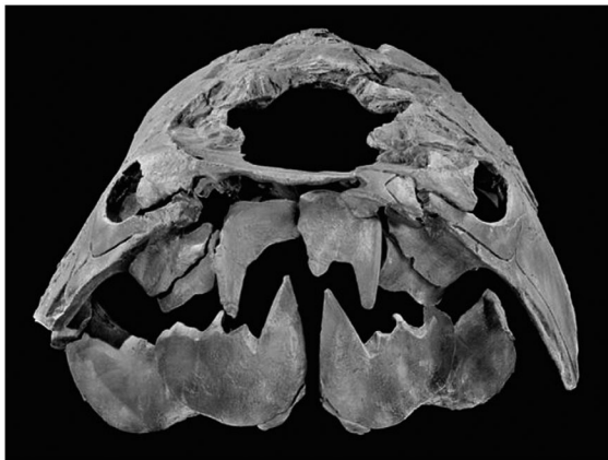
FIGURE 3 Frontal view of a fossil specimen of placoderm from Morocco illustrating the presence of the neural crest derivative the hinged jaw, which acquisition is concomitant with that of a compact myelin sheath in vertebrates. [Correction added on April 30, 2020, after first online publication: “Spitzberg” was changed to “Morocco” in the legend]

discussion). Moreover, in the earthworm and in shrimps ( Penaeus chinensis and Penaeus japonicus ) circular or fenestrated nodes that regularly disrupt the continuity of the glial sheath around the axon were observed that might provide the