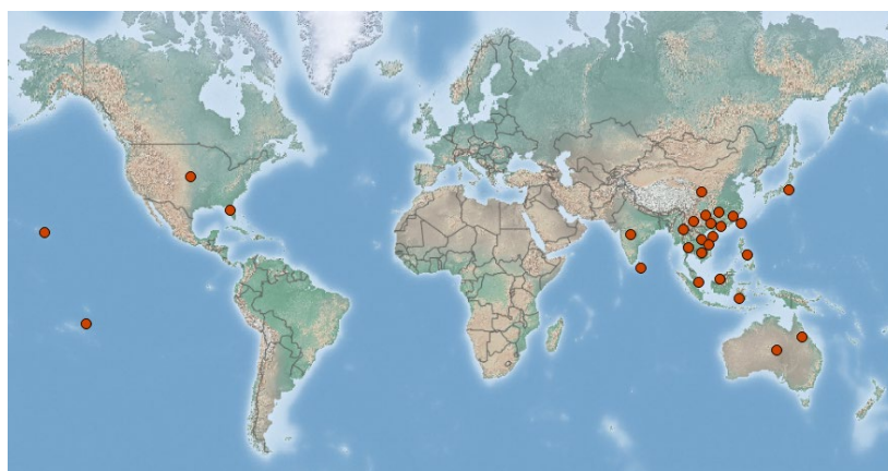
Fig. 2. Distribution of R. tomentosa around the world ( https://www.cabi.org/isc/datasheet/47297 ).

To date, there are no authoritative published comprehensive reviews of R. tomentosa included in the content of SCI. In this review, we compile the progress on phytochemical studies over the past decades, with all the elucidated structures listed. The biological characterization of the extracts or components isolated from R. tomentosa is summarized as well. The purpose of this article is to interpret recent advances on the chemical composition, pharmacology benefits and industrial applications of R. tomentosa .