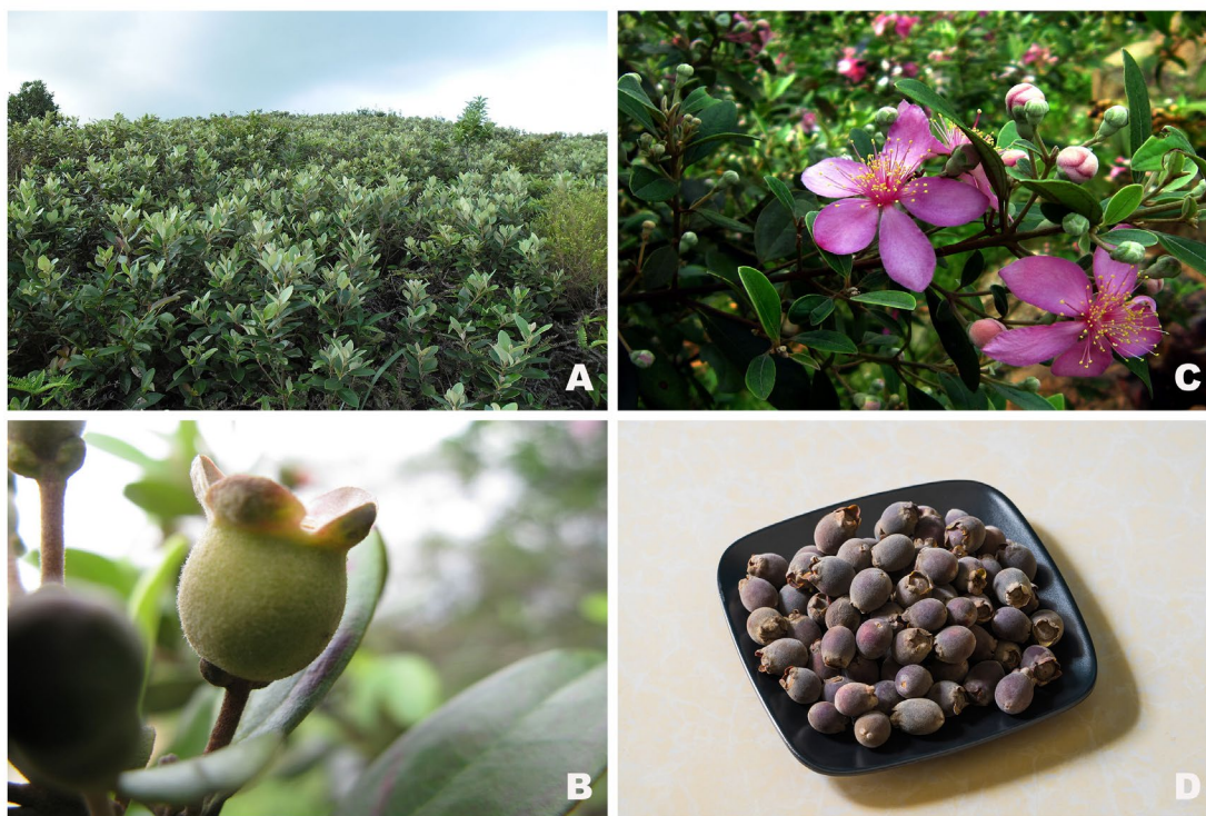
Fig. 1. R. tomentosa : (A) R. tomentosa bushes; (B) R. tomentosa immature fruit; (C) R. tomentosa flowers; (D) R. tomentosa fruits.

To date, there are no authoritative published comprehensive reviews of R. tomentosa included in the content of SCI. In this review, we compile the progress on phytochemical studies over the past decades, with all the elucidated structures listed. The biological characterization of the extracts or components isolated from R. tomentosa is summarized as well. The purpose of this article is to interpret recent advances on the chemical composition, pharmacology benefits and industrial applications of R. tomentosa .