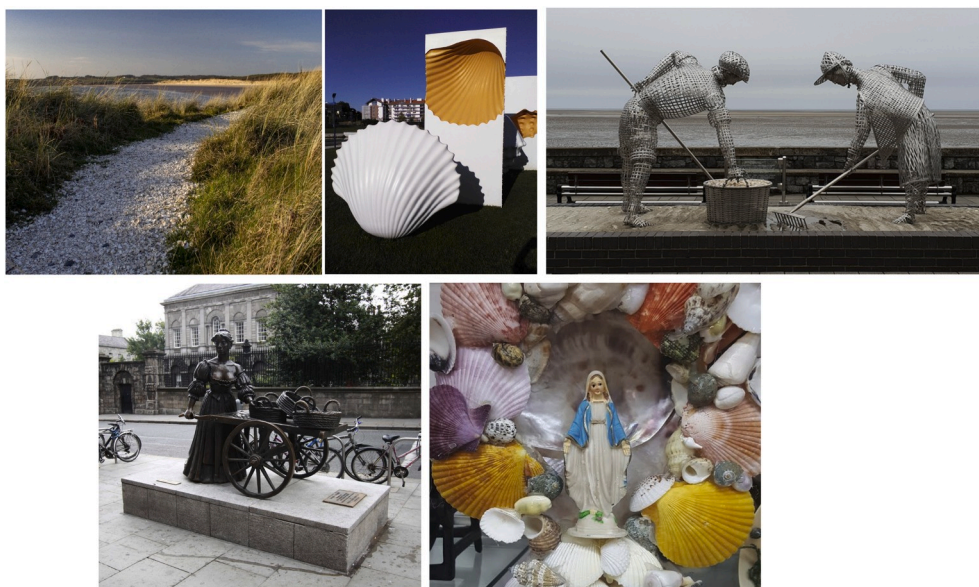
Fig. 1. Ecosystem service examples: cockles. Clockwise from top left: (a) cockle shells used on footpath on Ynys Llanddwyn, Wales © Andrew van der Schatte Olivier; (b) ‘Ovos Moles’ sculpture in Aveiro, Portugal © Laurence Jones; (c) ‘The Cocklepickers’ by Michéal McKeown in Blackrock, Co. Louth, Ireland. The sculpture overlooks Dundalk Bay, an important cockle harvesting area © Kate Mahony; (d) cockle shells as an element of a tourist trinket/souvenir © David Carss; (e) Molly Malone statue by Jeanne Rynhart in Dublin (Nol Aders, Wikimedia Commons [CC BY-SA 3.0 ( https://creativecommons.org/licenses/by-sa/3.0/ )]e)].

Bivalve aquaculture is gaining widespread attention because of its role in the carbon cycle in relation to mitigating climate change. Bivalves sequester carbon in the form of calcium carbonate via shell production (Peterson and Lipcius, 2003; Hickey, 2009). The average carbon content of a bivalve shell is 11.7%, although this varies between species. Currently there are no published figures for shell %C content of C. edule (van der Schatte Olivier et al., 2018). However, although shell formation fixes carbon, the biogeochemical processes involved also lead to the release of CO 2 into the atmosphere via the water column. Therefore, there is ongoing debate on whether there is a net sequestration of carbon as a result of shell formation, and whether it can be counted as an ecosystem service.