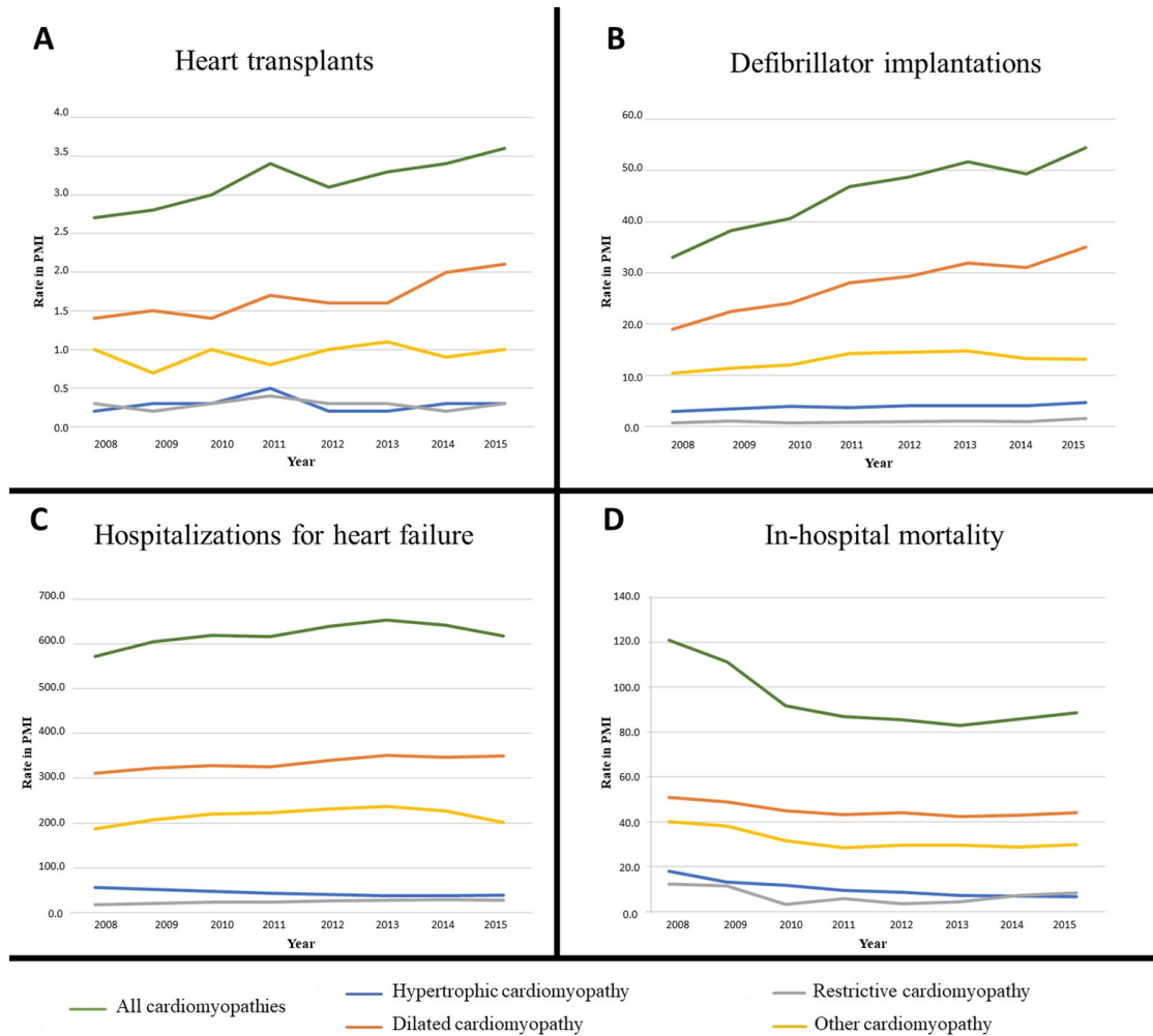
Figure 1. Temporal variations of inpatient prevalence of cardiomyopathy patients with at least one clinical event or procedure from 2008 to 2015:

A. Heart transplants; B. Defibrillator implantations; C. Heart failure; D. In-hospital mortality. PMI: per million inhabitants.