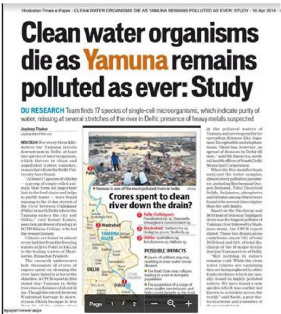
Fig. 5. Left panel: media attention following the organization of the International Symposium on Ciliate Biology, in 2018. Right panel: news on water pollution.