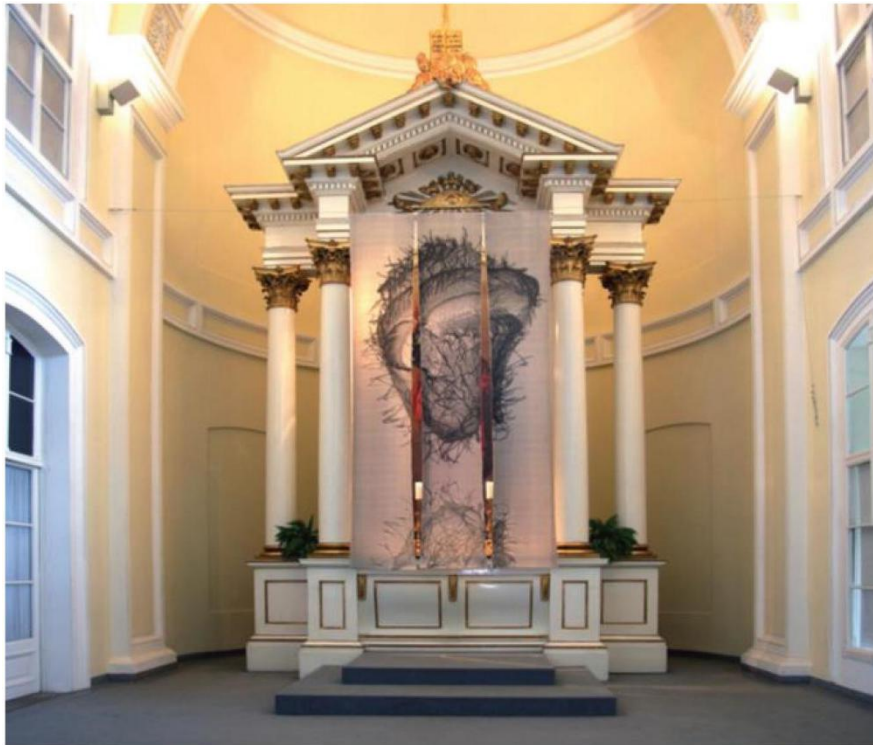
Fig. 6. A large-scale altarpiece of the ciliate Metopus at the „GEN 7“ exhibition, Salzburg, Austria, 2011. From Foissner (2012).