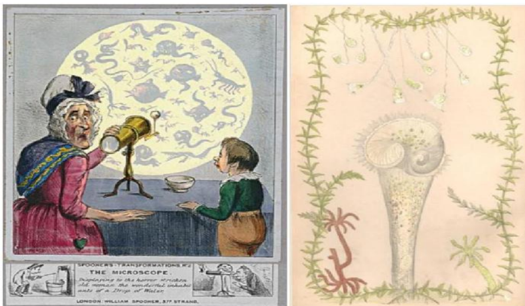
Fig.1. Left panel: an illustration by William Spooner, ca. 1835, showing the horror of discovering the microscopic inhabitants of a drop of water. Right panel: an illustration from Henry Slack's 1871 book, "Marvels of pond-life; or, A year's microscopic recreations among the polyps, infusoria, rotifers, water-bears and polyzoa", showing the beauty of aquatic microorganisms via an artistic composition of Stentor , Vorticella , algae and Hydra.

Efforts to popularise protists can be traced back to the 19th century (the Victorian Age in Great Britain) and the approaches used are still of some relevance. It was the time when relatively cheap mass-produced microscopes became available allowing microscopy to become a popular pastime. In public demonstrations and fairs, people first discovered, many with horror, the diversity of aquatic microorganisms in their drinking water (Fig. 1, left panel). Furthermore, the cholera epidemics of the 1840s and 1850s were eventually linked to some contaminated water supplies. Thus, aquatic microorganisms had a decidedly bad press.