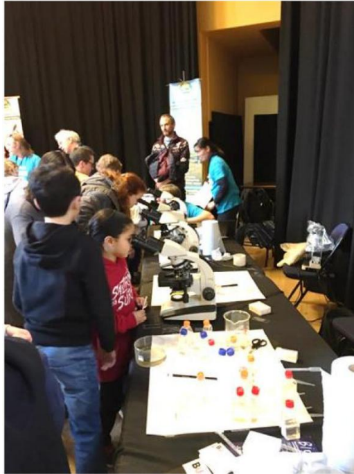
Fig. 3. Activity involving microscopes and protists at a family science festival organised by G. Esteban.

pink of the ciliate Blepharisma catching small flagellates with its oral cilia, is all too exhilarating for them to witness (Fig. 3). Whenever possible, activities that involve living protists are strongly encouraged. Any opportunity is suitable even if it is not strictly about science. In many cases the same activity can even fit for different kinds of public event, always remembering the WOW factor to impress children and adults, and to involve them in the activity so that they feel part of it.