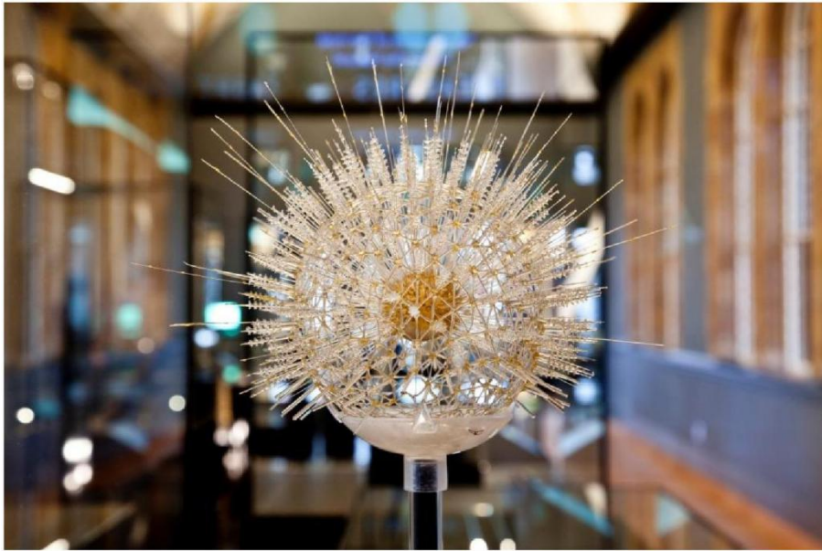
Fig. 2. Glass model of the phaeodarean Aulosphaera elegantissima Haeckel by Leopold and Rudolf Blaschka. © Trustees of the Natural History Museum, London, UK.