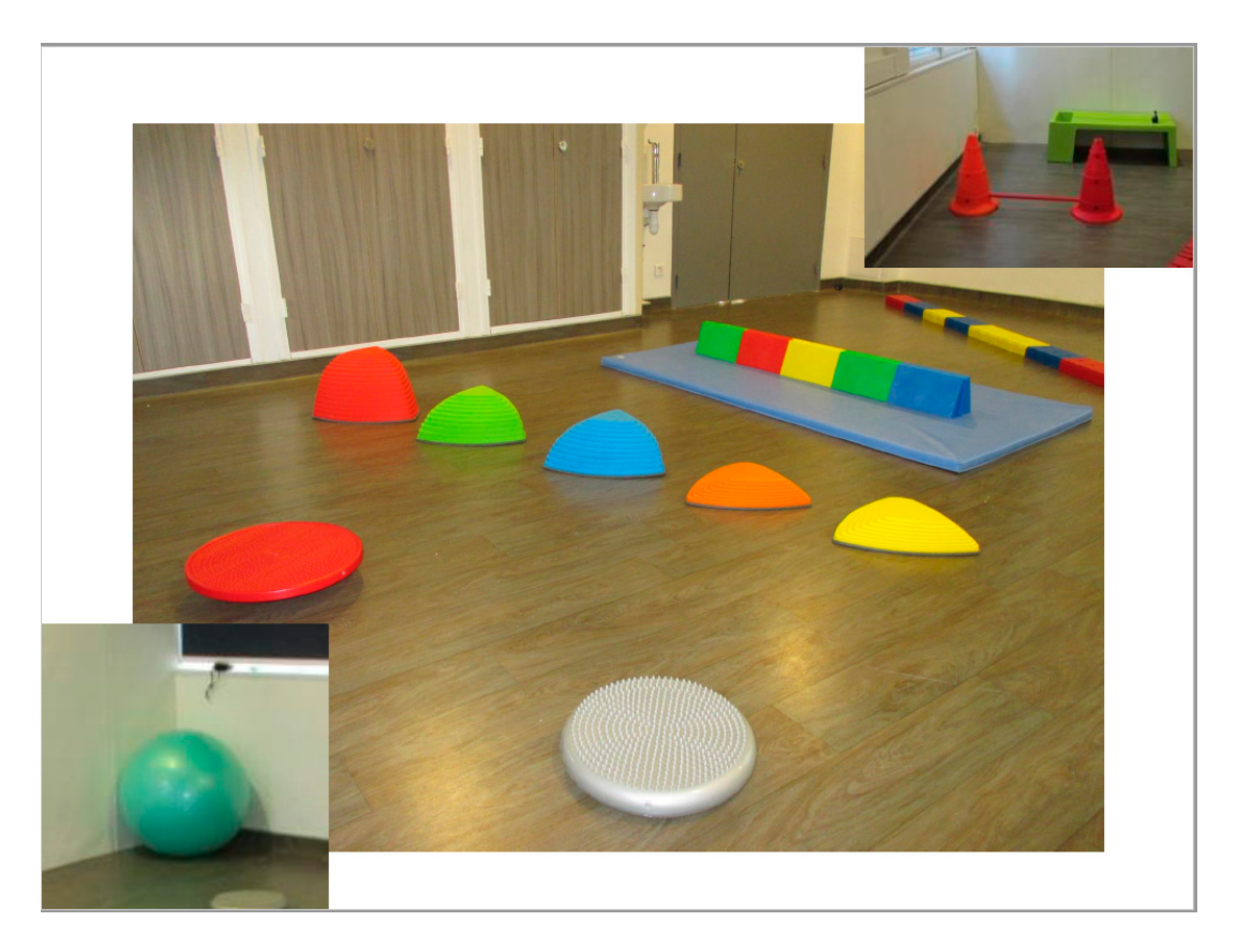
Figure 3. Setting of the self-design motricity path.

The sequences of the tasks were not repeated, in order to avoid motor learning between sessions. All tasks were performed in the same room and by the same professional team at the child psychiatry department of the Pitié-Salpêtrière Hospital. When CGs were indicated after discharge, a time-lapse was respected such that the patient could adapt to his/her non-hospital environment.