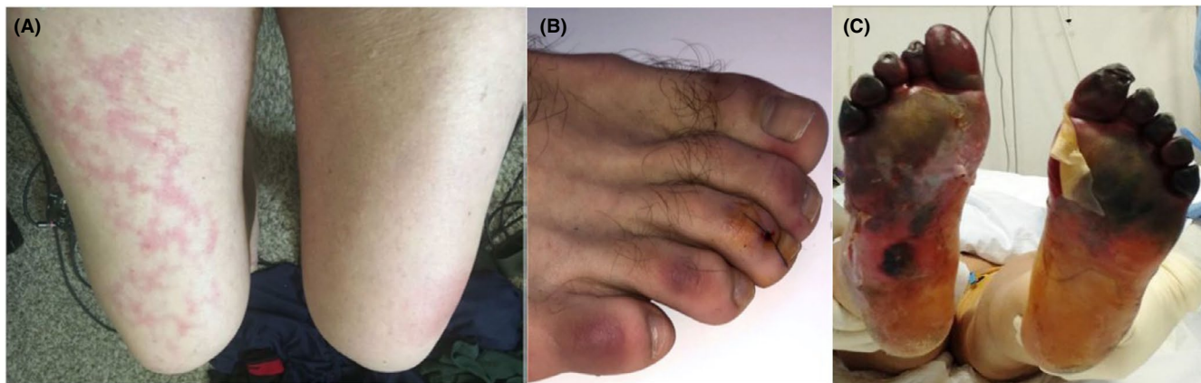
FIGURE 3 Skin manifestations associated with thrombovascular events and vascular pathologies. A, Transient unilateral livedo reticularis (erythema ab igne), 34 B, COVID-19-induced chilblains, 35 C, Acro-ischemia with cyanosis, skin bulla, and dry gangrene in critically ill patient 38

manifestations. Necrotic lesions occurred in older and in severely ill patients with increased mortality. 22 Cutaneous acro-ischemic microthromboses and small blood vessel occlusion have to be further explored for their causality and specificity for COVID-19 manifestations.