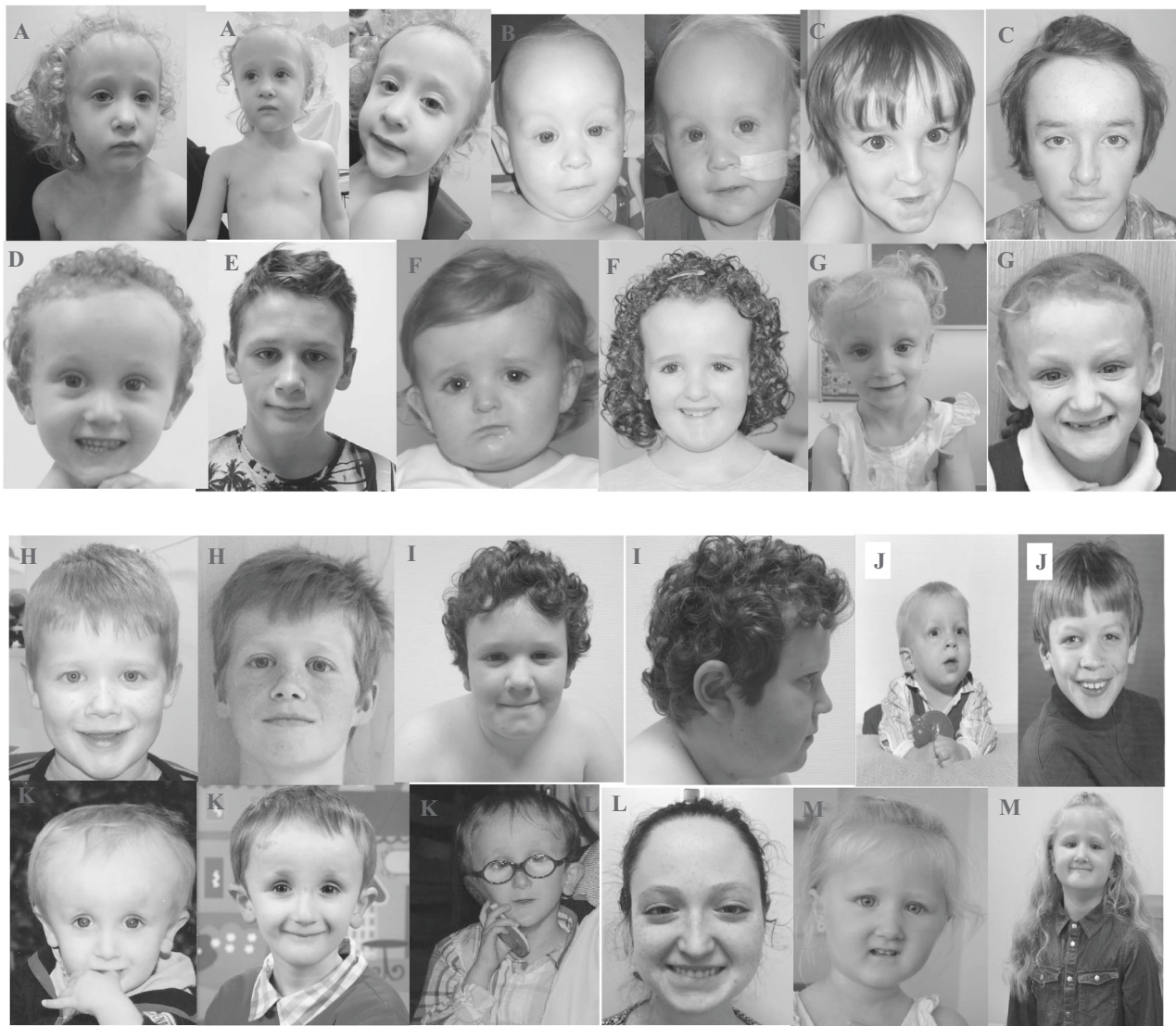
Fig. 1 Characteristic facial appearance of patients with variants in SIN3A. Note the high forehead, small, pointed chin and down-slanting palpebral fissures. A: Patient 1, B Patient 2, C Patient 4, D Patient 5, E

F Patient 9, F Patient 11, G Patient 12, H Patient 13, I Patient 16, J Patient 18, K Patient 25, L Patient 27, M Patient 28.