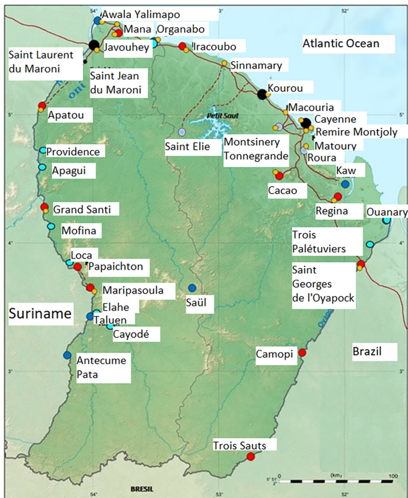
FIG 1 Map of French Guiana and the Health Centres for Remote Areas, showing hospital centers (black dots), remote health centers with a permanent physician (red dots), health centers with a permanent nurse but no physician (blue dots), closed health centers (gray dots), pregnancy centers (yellow dots), and temporary health missions (sky-blue dots).

species corresponded to the surveillance and alert mission of the National Reference Centre (CNR) of Leishmania . The conduct of the study complied with the French rules for research involving human subjects and the Helsinki Declaration guidelines. All patients were informed (through leaflets and posters in several local languages) that data and analysis results might be used in research and scientific publications and that they had a right to refuse. Informed consent was recorded in medical files. Under French law, no further legal clearance was required.