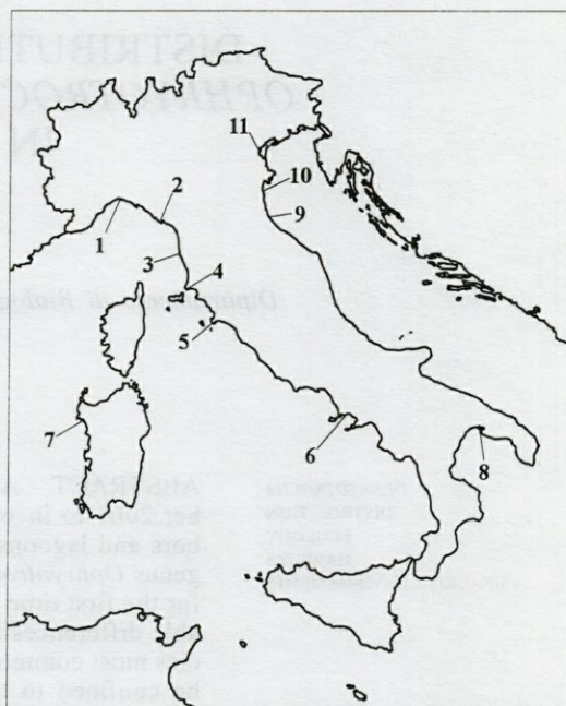
Fig. 1. – Localities in which one or more species of Ophryotrocha were found (data from present study and previous investigation). 1) Genoa harbor; 2) La Spezia harbor; 3) Leghorn harbor; 4) Piombino harbor; 5) Orbetello lagoon; 6) Gulf of Naples; 7) Alghero harbor; 8) Mar Piccolo of Taranto; 9) Rimini harbor; 10) Ravenna harbor; 11) Venice lagoon.

Some specimens were narcotised with MgCl 2 , observed under a stereomicroscope (Zeiss Stemi 2000-C) and photographed in vivo with a digital camera (Polaroid