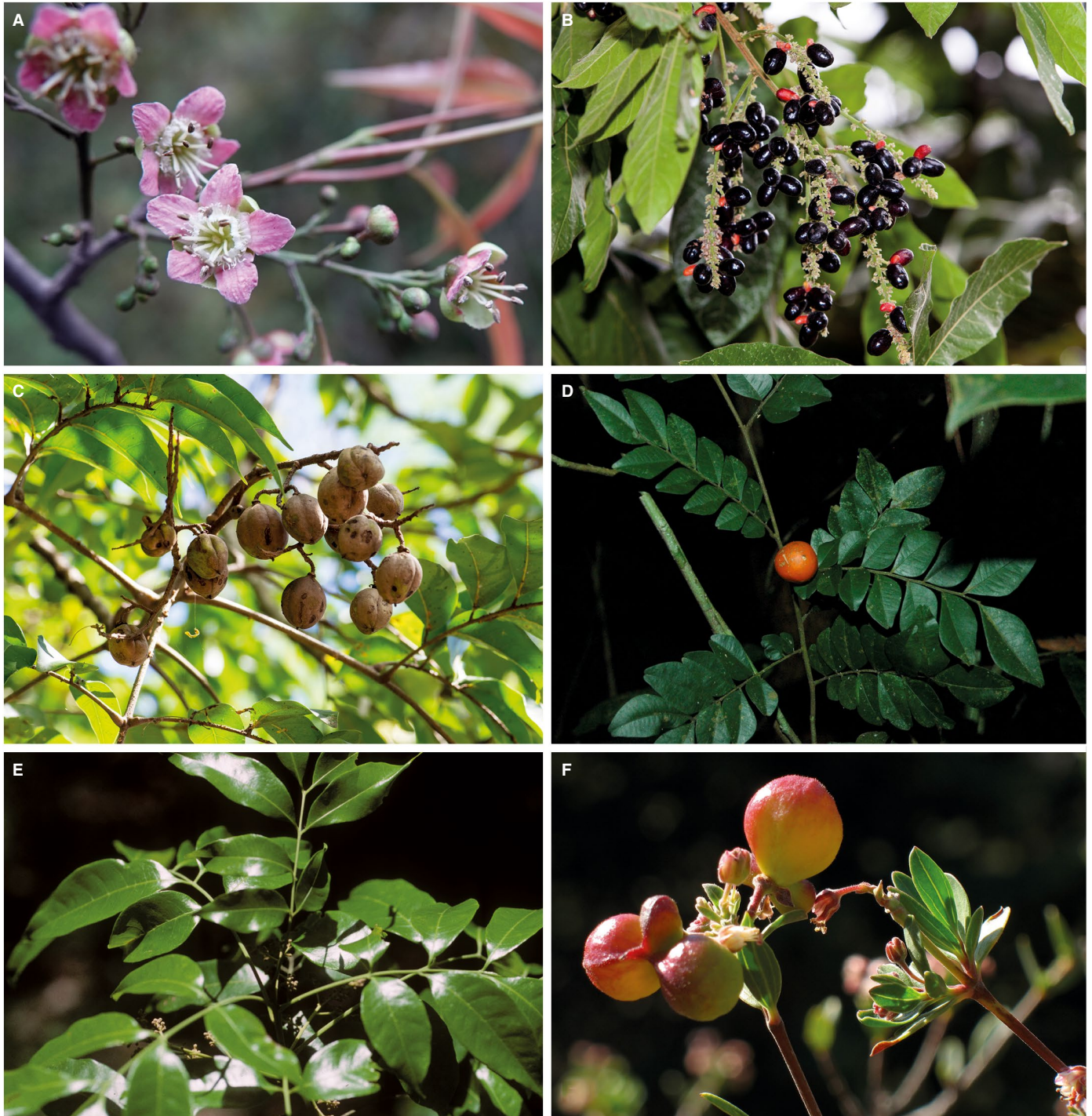
FIGURE 3. (A) Delavaya toxocarpa , China (Boufford 44087). (B) Lepisanthes rubiginosa , Thailand (Callmänder et al. 1167). (C) Tristiropsis obtusangula , Guam. (D) Haplocoelum intermedium , Gabon (Nguema 732). (E) Blomia pisca , Mexico (Acevedo-Rodríguez 12242). (F) Guindilia trinervis , Chile.

that define this clade, but suspect that floral features may be useful for its characterization.