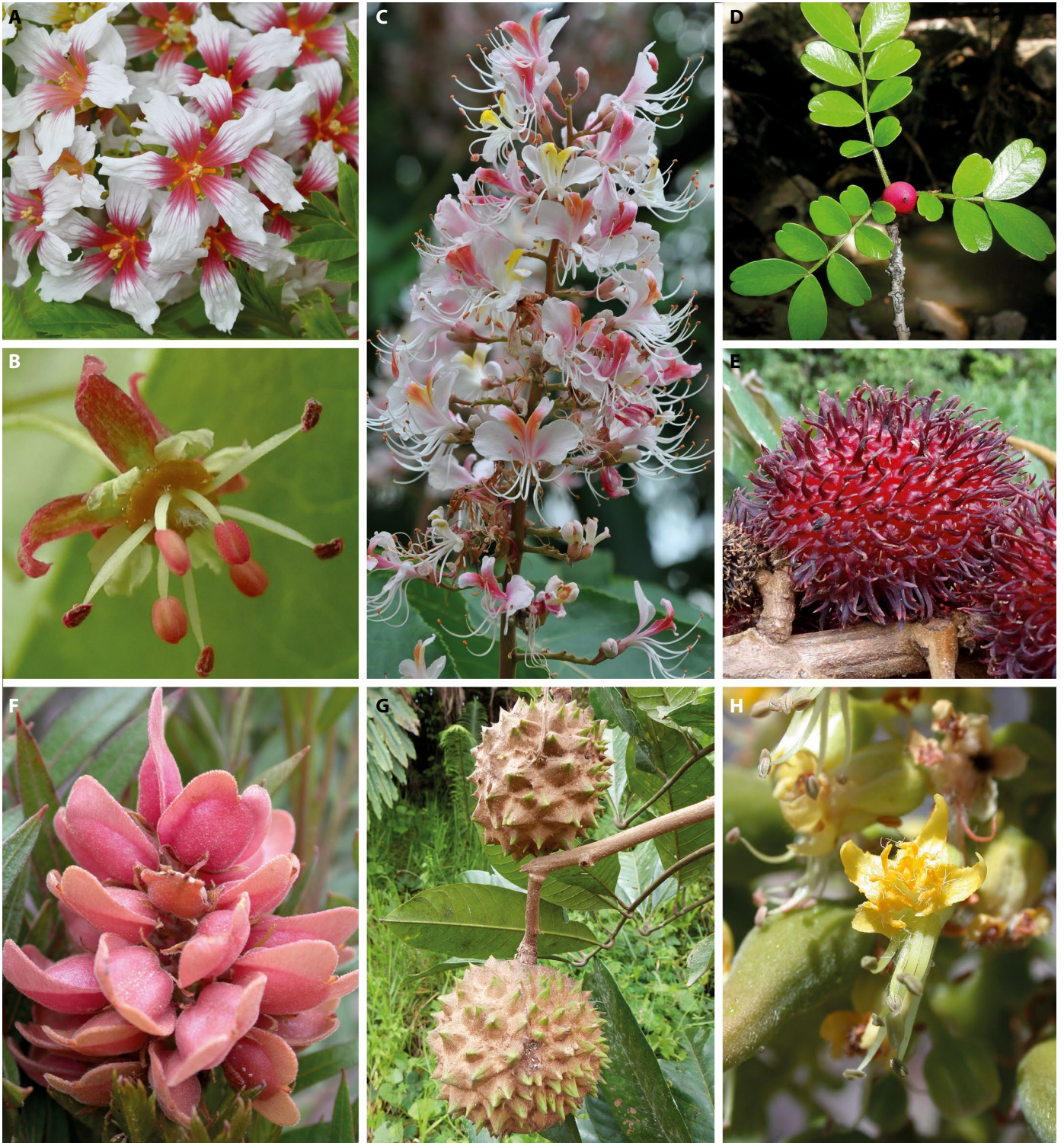
FIGURE 2. (A) Xanthoceras sorbifolia , cultivated at Royal Botanic Gardens, Kew, UK. (B) Acer campbellii var. serratifolium , China (Boufford 43672). (C) Aesculus indica cultivated at Royal Botanic Gardens, Kew, UK. (D) Doratoxylon chouxi , Madagascar (Rakotovao et al. 6303). (E) Nephelium cuspidatum , Malaysia (Borneo) (Buerki et al. 359). (F) Dodonaea madagascariensis , Madagascar (Lowry 6285). (G) Paranephelium joannis , Malaysia (Borneo) (Buerki et al. 358). (H) Erythrophysa aesculina , Madagascar (Phillipson 5704).