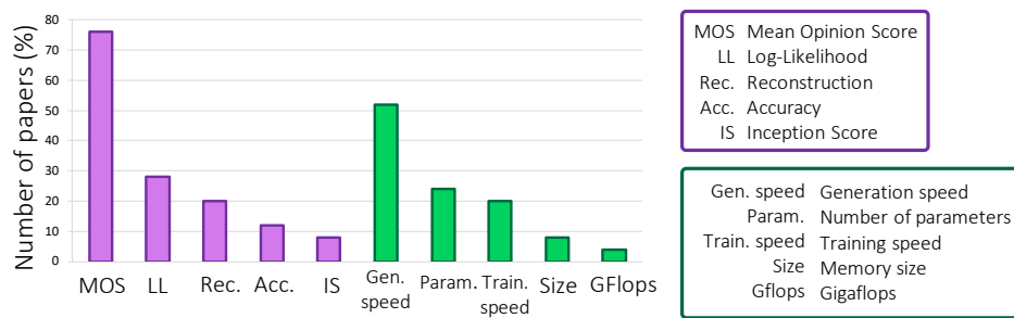
Figure 1: Distribution of commonly-used measures to compare and evaluate generative audio models. In purple (left) those that refer to the quality of the generated samples, and in green (right) those that refer to their algorithmic complexity and performances.

Generative audio models are promising advances for speech synthesis and music production. As a reminder, We also question the possibility to embed such models and hope our approach will allow preserving the battery lifetime by ranking the number of parameters at the same level as gains in quality.