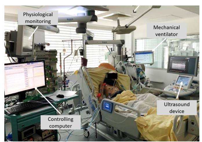
Fig. 1. Experimental setup. All acquisitions were performed in the patient's room. The ultrasound device was connected to a controlling computer, which was synchronizing and recording ultrasound images (SWE and Bmode) and physiological data.

Then the propagating shear wave was captured using an ultrafast imaging sequence (3500 frames.s<sup>-1</sup>) allowing its velocity measurement. By using a Matlab interface, B-Mode images and SWE maps where retrieved. The conventional SWE framerate of the device is set to 1 Hz. The SWE sequence was then modified to reach 2 Hz and sometime decreased to 1.6 Hz depending on diaphragm depth.