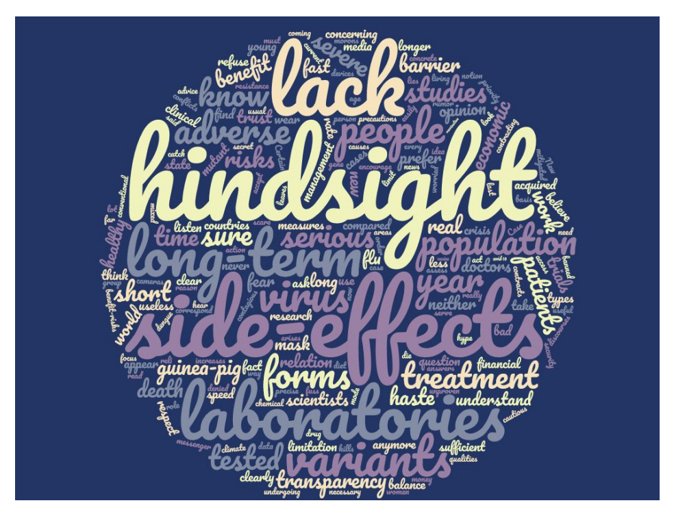
Figure 2. Word cloud from health care workers' responses to open-ended questions against COVID-19 vaccination.