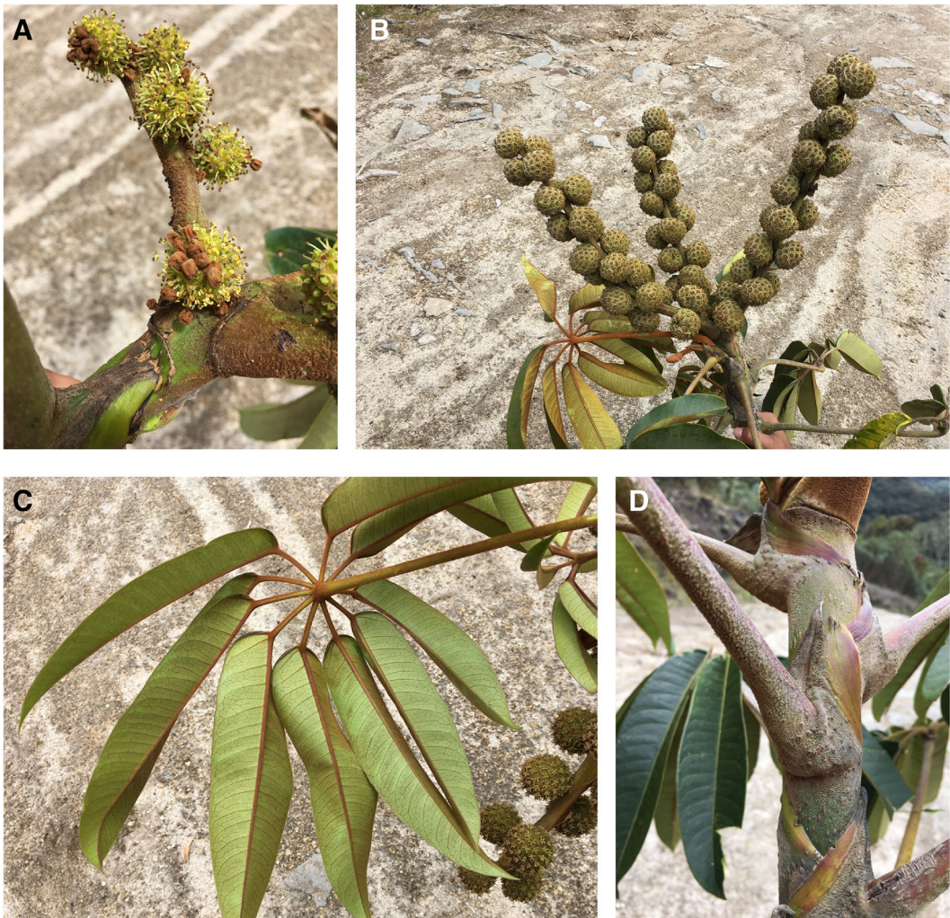
FIG. 1. Sciodaphyllum basiorevolutum A. Heads in flower showing calyprate corollas covered with reddish-brown pubescent indument. B. Inflorescence of large globose heads. C. Leaflets showing strongly revolute margins at the base. D. Ligulate stipules with green to purple scarious margins.

trichomes when young, adaxial surface glabrescent in mature leaflets, indument persistent on abaxial surface, base obtuse to rounded or truncate, margin entire, strongly revolute toward the base (the fold up to 5 mm wide), apex acuminate to attenuate, venation pinnate, primary vein prominent, slightly raised and yellowish-green adaxially, strongly raised abaxially, secondary veins 17–26 on each side, visible to obscure adaxially, raised abaxially, tertiary veins obscure adaxially, visible abaxially, inter-secondary veins present, proximal 2–5 secondary veins originating together