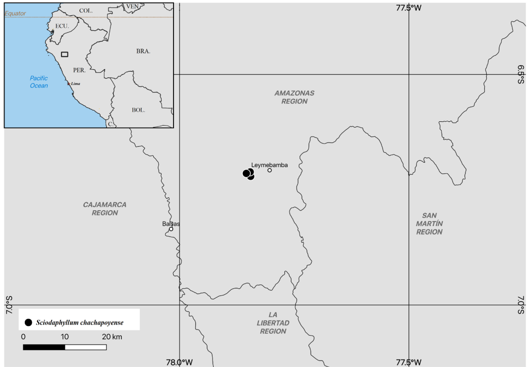
FIG. 4. Geographic distribution of Sciodaphyllum chachapoyense .

petals 5, 1.7–2.4 × 2.6–2.9 mm; stamens 5, in a single series, filaments 2.9–3.8 mm long at pollen presentation, anthers drying ferruginous to black, 0.9–1.2 mm long; ovary 5-carpellate, drying ferruginous to tan; styles 5, forming a column with a bulbous base, appressed before receptivity, spreading at maturity, drying black, 2.5–3.1 mm long, united for ca. two thirds of their length. Fruits fleshy, obpyramidal, transversely square or pentagonal, closely appressed to one another, 5.8–8.6 × 4.1–5.3 mm, base truncate to conical, with 5 ribs when dry (as many as the carpels).