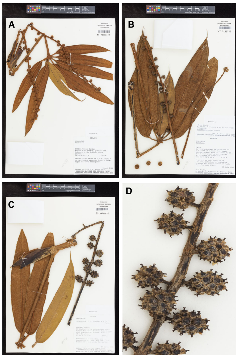
FIG. 5. Sciodaphyllum rufilanceolatum . A. Specimen in bud, Palacios 7220 [MO04853109]. B. Specimen in flower, Boyle 3423 [MO05181355]. C. Specimen in fruit, Palacios 12,491 [MO04799627]. D. Close-up of fruits of Palacios 12,491 [MO04799627].

78°12'W), 2690 m, 24 Jul 1993 [b, fr], Boyle 2344 (AAU, MO); Cerro Golondrinas, valley bottom ca. 1 km NNE of summit, 00°51'38"N, 78°08'14"W, 2740 m, 20 Jul 1994 [st], Boyle 3340 (AAU); Cerro Golondrinas, valley bottom ca. 1.5 km NNE of summit, 00°51'52"N, 78°08'10"W, 2750