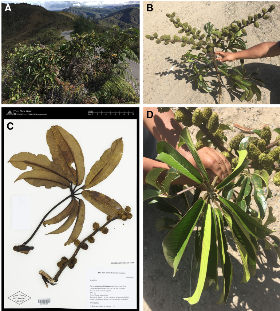
FIG. 3. Sciodaphyllum chachapoyense . A. Branched treelet growing in fern-dominated ( Pteridium arachnoideum ) open and disturbed area. B. Inflorescence of large globose heads. C. Specimen in bud and flower, Rodrigues-Vaz 147 [NY03108726]. D. Leaf showing conduplicate leaflets.

axis 3.6–11.1 cm long; secondary axes 2 or 3, 21.5–31 cm long; ultimate units heads, spherical to ovoid or ellipsoid, 1.1–1.6 cm diam. in bud, expanding to 1.5–3.5 cm diam. in fruit, sessile to pedunculate, peduncle, when present, up to 9.3 mm long, 3.3–5.1 mm diam. Flowers hermaphroditic, 62–94 per head, closely appressed to one another; calyx a low undulate rim/crown, up to 0.4 mm high, 2.8–4.4 mm wide; corolla calyprate, pale green (sometimes tinged with red), turning brownish when dry, with silvery-white floccose to lanate indument comprising branched trichomes, broadly cylindrical, with a